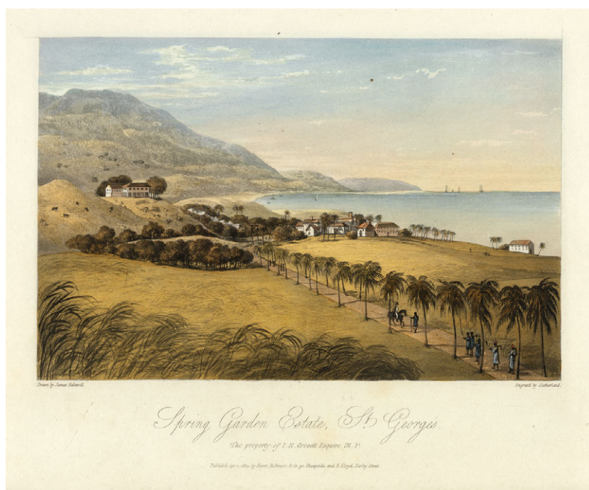
Figure I.5 James Hakewill, “Spring Garden Estate, St. Georges,” from A Picturesque Tour of the Island of Jamaica . London: Hurst and Robinson, 1825.

staffage – that is, human decoration – in the best picturesque tradition.” 52 Hakewill’s illustration of the Spring Garden Estate in St. George’s parish presents the plantation as a lush environment strictly controlled by orderly straight lines and buildings (Figure I.5). All visible human figures are walking on a straight, narrow paved road that facilitates the export of plantation commodities while maintaining order. The ripe sugar cane to the left side of the engraving wave as if in motion, which, like other images that deploy the planter picturesque, as Evelyn O’Callaghan observes, seeks to “naturalize colonial transplantation, masking the materialist matrix of the plantation economy by imposing an aesthetic screen of picturesque composition.” 53 Mountains rise in a blurred distance, the sites of the Black geographies of the provision grounds and Maroon communities that functioned outside of the gaze and logic of the plantation. Nathan K. Hensley argues, “traces of such halfway freedoms exist in the white supremacist