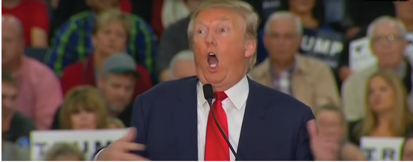
Figure 1. Donald J. Trump mocks Serge F. Kovalski

gradually emerged in higher resolution and became more vivid. When she first quoted him, the voice was barely differentiated from its narrative surround. Later, Noy used altered speech, her arms, and her head to enact a caricatured figure that stood out starkly against her own voice.