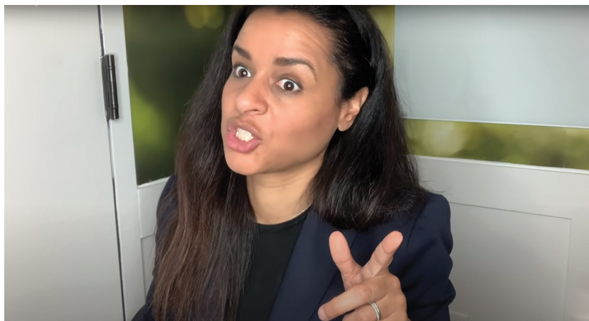
Figure 2. Sarah Cooper impersonates Trump using audio of him speaking [Source: “How to person woman man camera tv”; https://www.youtube.com/watch?v=j80aaP68i4s ; accessed September 24, 2020]

Some studies still discuss represented discourse as if it were only either sonic or written, and many linguistic anthropologists continue to exclusively use audio recordings—rather than video recordings—of interactions, even when those interactions occur in environments where participants also have visual access to one another. But this is changing. In the last decade research on re-enactments, bodily-quoting, constructed action, and the multi-modality of reported speech has blossomed (e.g., Clark and Gerrig 1990; Haviland 1993; Streeck 2002; Sidnell 2006; Goodwin 2007; Keevallik 2010; Keevallik 2013; Sandlund 2014; Cormier, Smith, and Sevcikova-Sehyr 2015; Stec, Huiskes, and Redeker 2015; Stec, Huiskes, and Redeker 2016; Hodge and Cormier 2019). While some of this research draws a distinction between representations of bodily movements and spoken discourse, the concept of figure composition is in line with a growing consensus that “verbal and bodily quoting are essentially the same kinds of activities” (Keevallik 2010, 402).