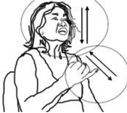
Figure 4. The axes along which Noy moves her body during line [29]. 27

the referential function is most dominant in [27], in [29] the poetic function—characterized by an orientation towards the form of language (or, in Jakobson’s vocabulary, the message)—is thrust into focus (Jakobson 1956; Jakobson 1960). To play on the title of Dell Hymes’s (1981) classic paper, line [29] is a “break-through into poetics,” a moment where the contrastive individuation of the figure’s composition (Agha 2005, 54) is made a thematic focus and brought to attention in and of itself.