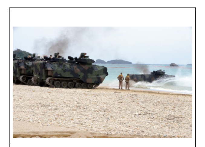
US amphibious vehicles take to the sea at Henoko, 9:45 am on 8 December 2014

Henoko, the hamlet chosen for this project, happens to be one of the most bio-diverse and spectacularly beautiful coastal zones in all Japan, one that its Ministry of the Environment wants to promote as a UNESCO World Heritage Site. It hosts a cornucopia of life forms from blue—and many other species of—coral (with the countless microorganisms to which they are host) through crustaceans, sea cucumbers and seaweeds and hundreds of species of shrimp, snail, fish, tortoise, snake and mammal. Many are rare or endangered, and strictly protected, none more so than the critically endangered dugong.