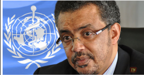
Dr. Tedros Adhanom Ghebreyesus, Director-General, World Health Organization