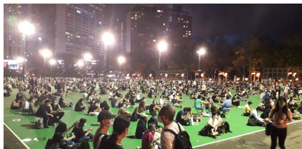
Protesters maintaining social distancing at the candle-lit vigil held in Hong Kong island's Victoria Park on 4 June 2020.

The one exception to this pattern of banning protests and then arresting or fining attendees was the gathering held on 4 June to mark the 31st anniversary of China's suppression of the 1989 student-led democracy movement in Beijing. Despite having declared the gathering illegal, police did nothing to prevent several thousand people from entering the site of the vigil, Victoria Park on Hong Kong island, and remaining there for the next hour or so, before departing peacefully. One week later, however, several leaders of the event were charged with inciting others to join an illegal assembly (RTHK 2020).