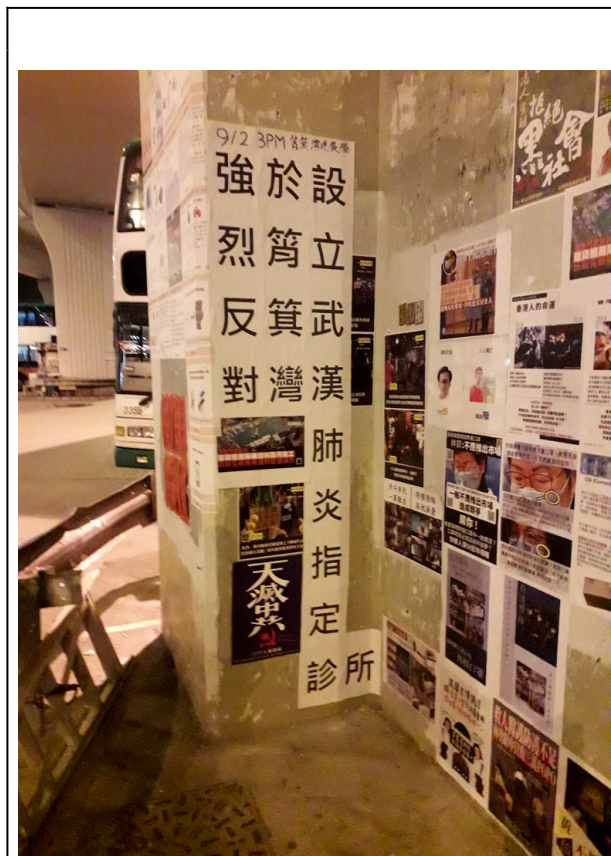
Poster opposing the establishment of a Covid-19 clinic in Hong Kong island's Shau Kei Wan district.

actions made sense. Within a few days of the first confirmed case, mask wearing in public was ubiquitous and has remained that way until now, despite the near total absence of local cases. In Hong Kong, among the local population, there is no stigma to wearing a mask in public. It was noticeable, though, even to the most casual of observers, that European and American expatriates, especially males, took significantly longer to embrace the mask-wearing habit. On 16 March, Apple Daily , a popular (pro-democracy) newspaper, featured a front-page picture of a group of expatriates socialising outside a bar under the headline “Westerners freely walking around without wearing masks” ( Apple Daily 2020).