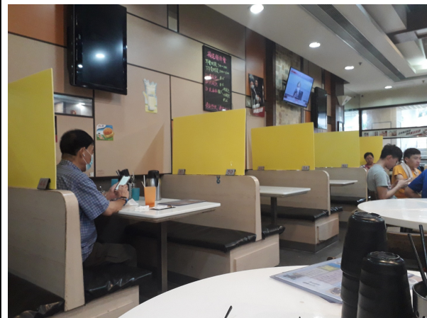
Temporary partitions aimed at impeding the spread of Covid-19 installed in a Hong Kong café.

The very fact that Hong Kong never had to undergo a full lockdown points to the success of the first two measures in lessening the need for the kind of restrictions imposed in many other countries.