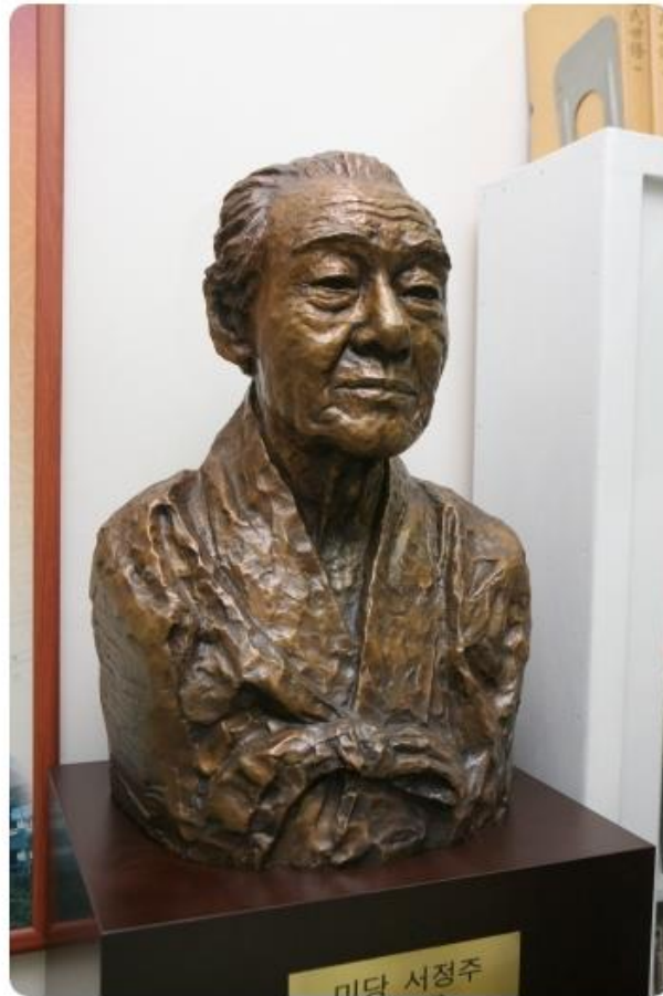
A bronze statue of Sŏ Jŏng-ju. While respected as Korea's greatest poet, the controversy surround his work as a pro-Japanese writer continues to rage in Korea.

story, the protagonist, Ch'oe, a “postman in a small town by the sea in southern Korea,” is desperately trying to acquire Japanese identity. Ch'oe is a “reliable and trustworthy man of average build,” who delivers the mail not only in his own village, but also far and wide to “small villages in the deep mountains and down by the seashore.” Although his wife has passed away, he has a “mother who is blind in one eye,” and “a son who is a second-year student in elementary school.”