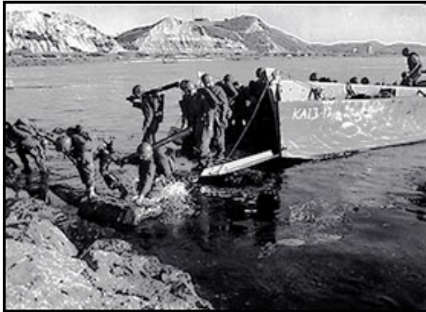
The US Army's 7th Cavalry Unit in Korea

Such communications would have been recorded in the 7th Cavalry Regiment's journal, but that log is missing without explanation from the National Archives. Without disclosing this crucial gap, the Army's 2001 report asserted there were no such orders. It suggested soldiers shot the refugees in a panic, questioned estimates of hundreds of dead, and absolved the U.S. military of liability.