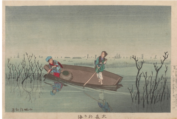
Morning Sea at Omori. 1880 woodblock print by Kobayashi Kiyochika. Behind the two seaweed gatherers in Tokyo Bay, two rectangular reclaimed fortress islands (daiba) and a Western ship can be seen. Image in Ulak's visual narrative, "Kiyochika's Tokyo: Master of Modern Melancholy"

well as the Olympics' connection to the environment in Japan before looking more closely at the transformation of Tokyo Bay for the 2020 Olympics.