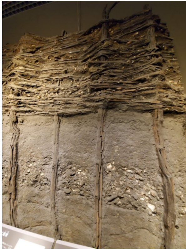
“Slice of Tokyo Bay landfill taken from Shiodome on display at Edo-Tokyo Museum” Photo by author in July 2019.

As Tokyo’s population continued to grow into the 19 th and 20 th centuries, Tokyo Bay continued to shrink as the coastline was built out and new islands emerged. 2 From its natural coastline to the present day, the stages of large-scale land reclamation in Tokyo Bay can be roughly broken down into four periods: 3