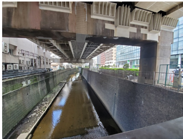
Waterway under a highway in Minato Ward, Tokyo, 2019.

significant environmental cost. As American author Robert Whiting, a longtime resident of Japan, has written, the massive construction for the 1964 Games exacted a terrible toll on the rivers of Tokyo. Whiting observed that “By planting supporting columns of the highways and other structures in the water below, many river docks were rendered useless [...], water stagnated, fish died and biochemical sludge, known as hedoro in Japanese, formed” (Whiting 2014).