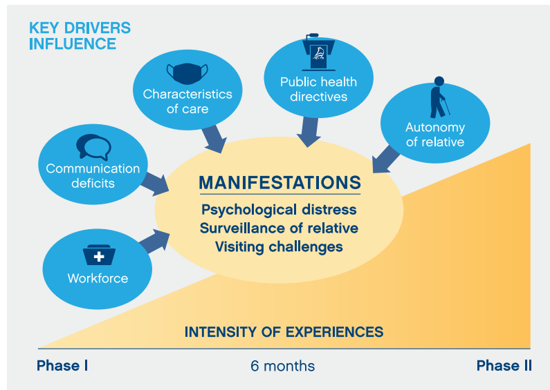
Figure 1. Families experience with a relative in LTC during the COVID-19 pandemic