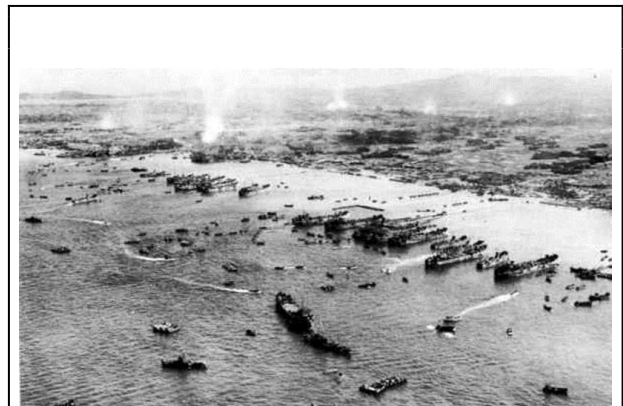
US Marine landing April 1, 1945 (Aerial view)

Early in the morning of 1 April 1945, a fleet of 1,300 vessels landed US forces on the beaches at Chatan and Yomitan either side of the mouth of the Hija River on the west side of central Okinawa. It was the start of fierce fighting that would last three months.