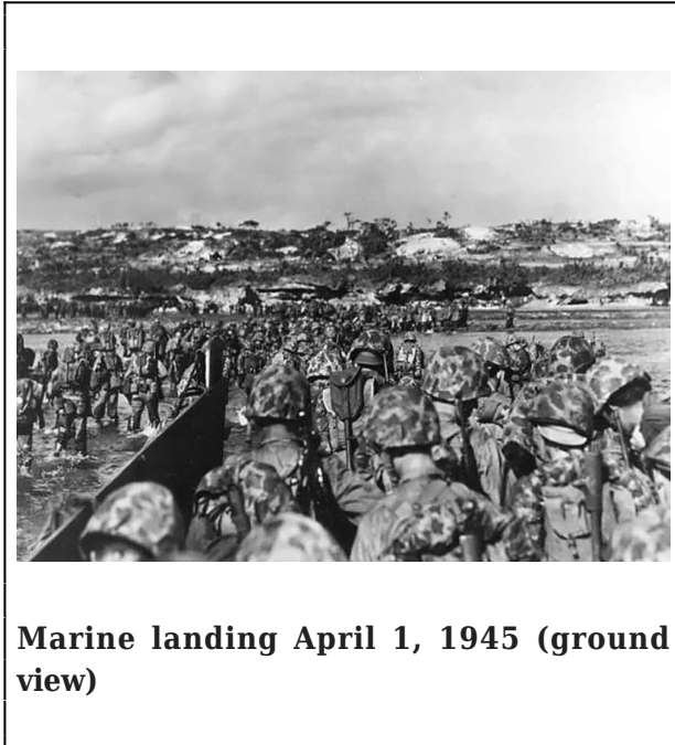
Marine landing April 1, 1945 (ground view)