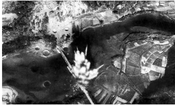
US bombing during the battle

As the carnage continued, in the Headquarters cave at Mabuni on 18 June Ushijima issued his last order, "The battlefield is now in such chaos that all communications have ceased. It is impossible for me to command you. Every man in these fortifications will follow his superior officer's orders and fight to the end for the sake of the motherland. This is my final order. Farewell." To this, his chief of staff, Lt. Gen. Cho added: "Do not suffer the shame of being taken prisoner. You will live for eternity." 51 After urging their troops to "fight to the end," within four days, both the commanders of the 32nd Army, Ushijima and Cho, had taken their own lives, thereby removing the opportunity for the remaining Japanese troops to carry out an organized surrender which would have helped to avoid the final "mopping-up" operations that claimed so many civilian victims. 52