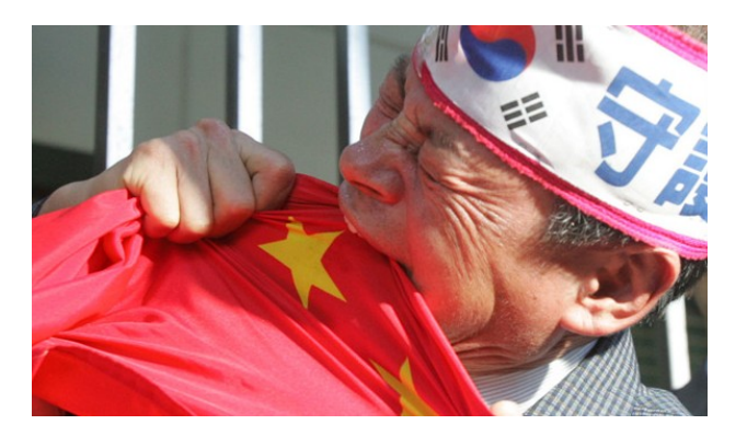
South Korean protester at the Chinese embassy in Seoul, 7 September 2006

Needless to say, few people in Korea accepted that these new actions of Chinese researchers were merely the result of academic curiosity, and general outrage followed. Noisy demonstrations took place in front of the Chinese embassy. Some ultra-nationalists even bit, chewed and then burned a Chinese flag in front of the cameras. President Roh decided to raise the issue during the recent summit with the Chinese chief executive, and Korean newspapers of all persuasions ran articles very critical of the Chinese positions. China's actions were widely seen as a unilateral breach of the 2004 agreement.