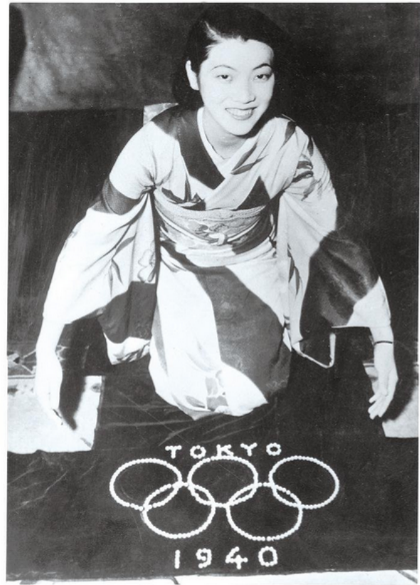
Model poses with strings of pearls arrayed in the Olympic logo.

At the closing ceremonies of the 11th Olympiad in Berlin --- memorialized in Leni Riefenstahl's film "Olympia" --- IOC President Latour announced to the crowd, "It has been decided that the next Olympics, in 1940, will be held in Tokyo."