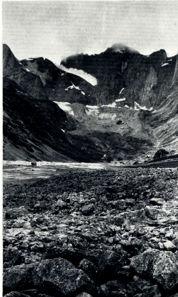
Fig. 3A. Combined terminal moraine of S2, A1 and west arm of A2. Older arcuate segment lies at the extreme front and sides; the younger component is on the cirque threshold. (Photograph by P. S. Smith; 567, 16 July 1911)

Smith's first camera station was located on top of a prominent granite boulder c. 2 m. high which lies at about 980 m. elevation in the valley bottom near Arrigetch Creek (Fig. 2). The boulder is about 100 m. north-west of the present stream margin and c. 0.7 km. down-valley from the terminus of the recent combined moraine of glaciers S2, A1 and A2. The clarity of the foreground detail in the 1911 photographs (Fig. 3A) allowed reproduction