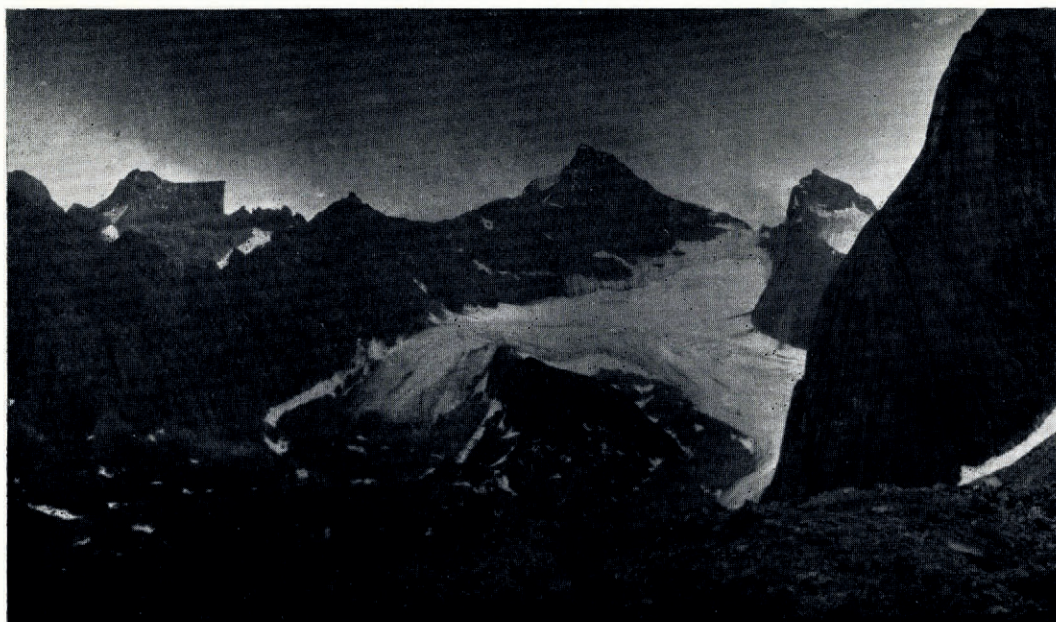
Fig. 4A. Cirque glacier complex at the head of the north fork of Arrigetch Creek. Note the ice in contact with the younger moraine substage. (Photograph by P. S. Smith; 570, 16 July 1911)

(4) The ice-cored moraine in the foreground has subsided an average of 2–3 m. from its 1911 position (dashed line, Fig. 4B). The down-slope movement of its surface boulders indicates continued spilling of boulders over the cirque threshold.