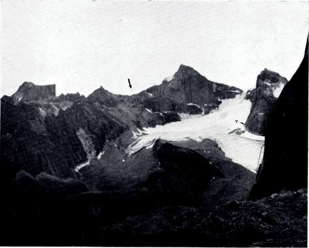
Fig. 4B. Same view as Figure 4A. Note the trimline (T), former position of the ice-cored moraine of S 1 (dashed line), thinning of Wichmann Glacier (arrow) and modification of the ridge tip (dotted outline). (Photograph by T. D. Hamilton, 14 August 1962; camera station 2-62)

(5) The snow line on the surface of glacier A 2 appears to have moved upward more than 100 m. since 1911, but this may be largely due to differences in the dates of the comparative photographs. Smith's photographs were taken in mid-July and the writer's nearly one month later in the summer.