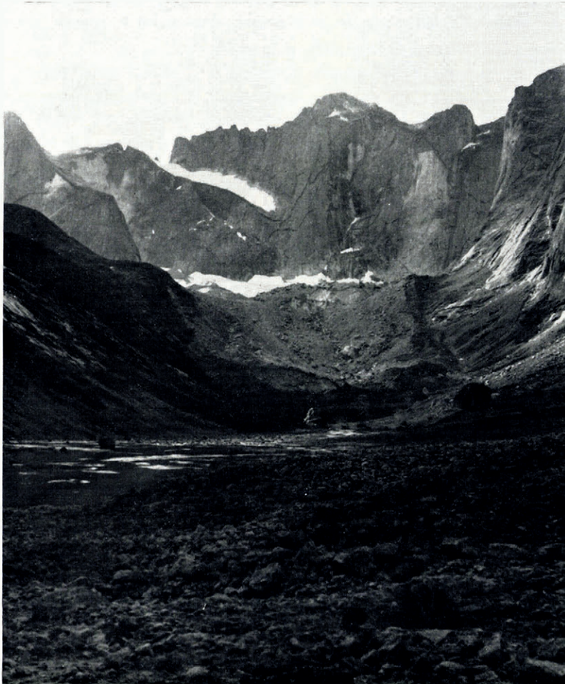
Fig. 3B. Same view as in Figure 3A. (14 August 1962, camera station 1-62)

(5) The large boulder in the stream floodplain (near left margin) has neither settled nor