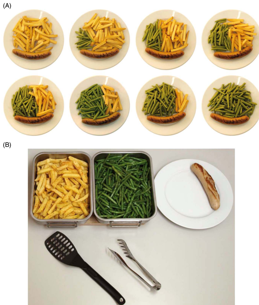
Fig. 2 (colour online) Students were invited for a cafeteria meal degustation. Sausage, fries and beans were offered. (A) Participants were asked in an online questionnaire to decide on the portion they would like to eat at the degustation event. Photographs were taken of food replicates produced by Döring GmbH, Munich, Germany. (B) Buffet offered to participants 24–48 h after they filled in the questionnaire. Photographs were taken of real foods that were offered at the degustation

second questionnaire to assess anthropometrics. Meanwhile, the experimenter weighed possible leftovers in another room, out of view of participants. Once each participant had finished serving his/her food, the vessels were refilled with fresh beans and fries for the next person.