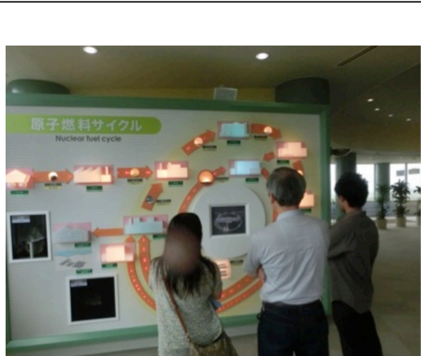
Rokkasho Visitor's center

Are the potential dangers of hosting a reactor an acceptable risk given the alternative of economic decline and depopulation? Many communities in remote coastal areas where Japan's fleet of reactors are sited are grappling with this calculus. Until now the fishing port of Oma has been known for its world famous bluefin tuna catches, but that is changing due to the town's decision to host a nuclear power plant. In 2014, the city of Hakodate in Hokkaido, located just across the Tsugaru Strait from Oma (located on Japan's main island of Honshu), filed a lawsuit against the central government and the utility to block ongoing construction of the Oma mixed-oxide fuel (MOX) reactor. (Asahi 4/11/2014) This is the first lawsuit of its kind in Japan in which a town is the plaintiff suing for an injunction to stop