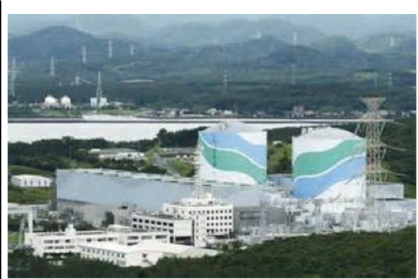
The NRA is fast-tracking safety approval for the Sendai plant in Kyushu despite being only 50 km distant from an active volcano

Although Abe's plans for a nuclear revival face hurdles, NRA approval of some restarts seems very likely by the end of 2014. In recent weeks, Abe has boosted the prospects for this outcome by moving to replace outgoing NRA commissioners with candidates who have a pronuclear track record. This political meddling in the safety review process will undermine its already limited credibility, but will facilitate reaching the foreordained conclusion in favor of restarts. However, giving the go-ahead for restarts requires ignoring significant risks.