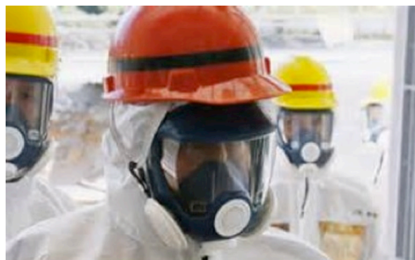
PM Abe Shinzo inspects stricken Fukushima plant

lobbying resources enjoys tremendous advantages that explain why it has prevailed over public opinion concerning national energy policy.