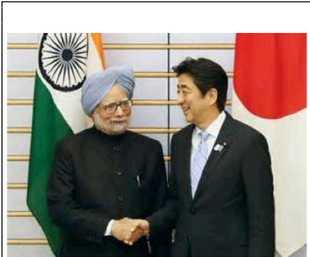
PM Abe, here meeting with former Indian premier Manmohan Singh, is eager to restart reactors to help promote nuclear exports

Post-Fukushima it seemed unlikely that Japan would restart nuclear reactors let alone export them, but both initiatives are central to PM Abe's agenda. The stakes are exceptionally high given the vast amount of money invested in the 48 viable reactors and the opportunity cost of foregoing this source of energy and decommissioning the plants. The vested interests in industry, government, and finance that have the most to lose from phasing out nuclear energy remain resolute and influential. Since the furor has subsided somewhat, nuclear energy has settled back into existing policy ruts; inertia trumped transformation because it is easier to sustain what exists than to mount an energy revolution that takes on established vested interests and challenges policy rigidities. Nonetheless, Japanese doubts remain high, especially because the stricken Fukushima plant continues to spew radiation into the ocean and the media has drawn attention to lingering safety issues and the unlearned lessons of Fukushima.