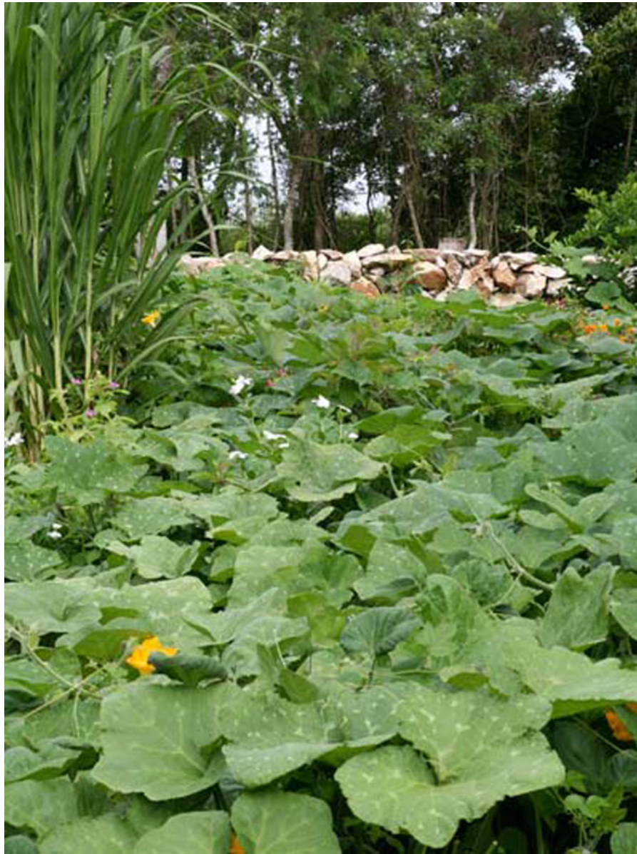
Figure 2. Squash growing in a house garden in Yaxunah.

usage to which the largest percentage of species in home gardens were dedicated was food.