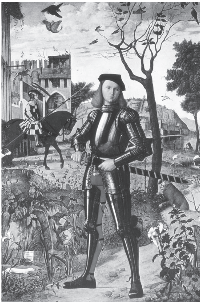
Figure 1: The ‘Knight with the Ermine’, probable portrait of Ferdinand II of Aragon, King of Naples (1467–96), by Vittore Carpaccio (Lugan, Thyssen Collection).