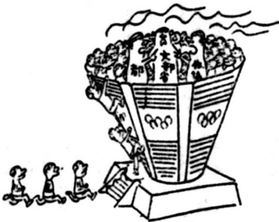
The Ministry of Education in the middle of the cauldron for the Olympic fire discussion with the metropolitan government and the Tokyo Organizing Committee ( Asahi Shinbun 1959, Month, Page).

infrastructural requirements of hosting the Olympic Games without extensive state support. The key role assumed by the Ministry of Education was expressed by a political cartoon that appeared in the Asahi Shinbun , which placed the Ministry in the middle of the cauldron for the Olympic flame while the city and the Organizing Committee are trying to make their points from opposite sides.