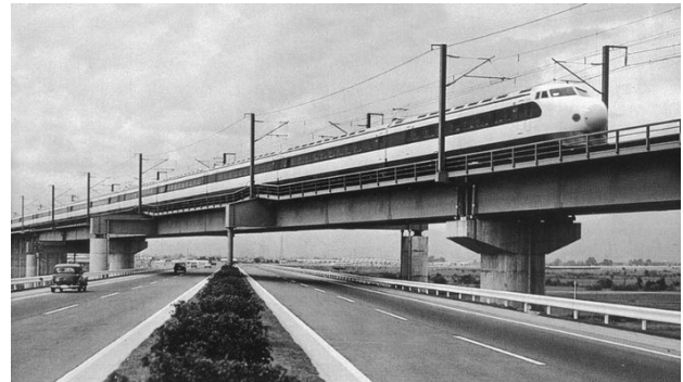
The Shinkansen, which started its service weeks before the opening ceremony, and the highway from Osaka to Nagoya, also inaugurated shortly before the Games, were the new national symbols of Japan as rising economic power.

for the first time just a few days prior to the opening of the Games and which was at the time the fastest train in the world. The world-wide broadcast of the games in color and via satellite demonstrated the high technological standards of the games, although Japan in fact relied heavily on assistance from America to make this possible.