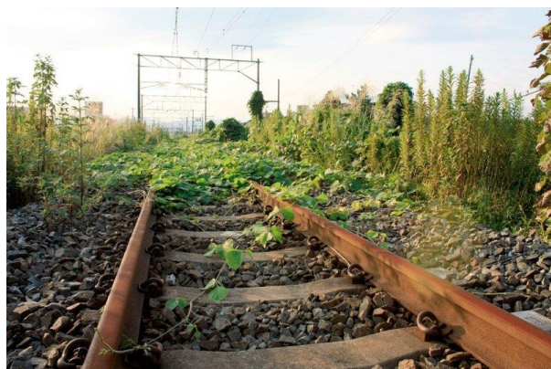
Namie became a ghost town

The crisis in Fukushima is even more serious in many respects. In Fukushima, the level of devastation is extremely high, and as at August 2012, approximately 111,000 people have been forced to evacuate by the government with no or limited prospects of returning to their homes. 35 The impact of the nuclear crisis is global rather than regional, and in respect of the ecosystem, it is not yet possible to determine its ultimate impact. The underlying power structure of the Japanese ‘nuclear village’ is more formidable than that of Chisso. Its power is reinforced by close links to the international nuclear regime. The causal link between exposure to the poison and illness is much harder to establish in the case of irradiation: low level irradiation does not result in distinctive symptoms as in Minamata disease; it takes many years to manifest as cancer, the cause of which is difficult to single out; and impact upon the unborn, infants and young children is unknown.