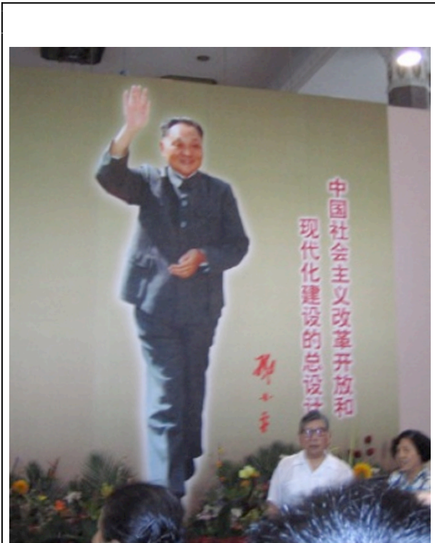
Entrance to the 2004 Deng Xiaoping exhibit at the National Museum of China, Beijing

exhibitionary spaces join in propagating official narratives of revolutionary history.