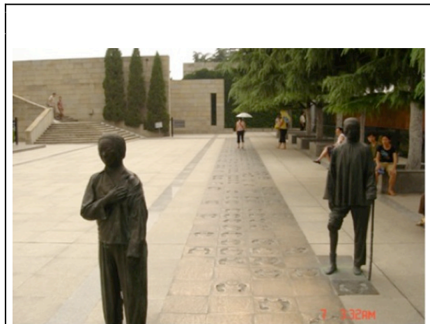
Footprints of Witnesses to History sculpture at the Nanjing Massacre Memorial Hall