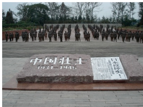
The “China’s Heroes” display at the Jianchuan Museum Cluster

To give a sense of the variety and extensiveness of museums in China, take for example a city like Nantong. Located not far from Shanghai, Nantong is, by Chinese standards, a middle-level city, with seven million inhabitants. It has some twenty museums and memorial halls, including museums devoted to textiles, architecture, folk arts, kites, sports, old age, water technology, and the abacus, as well as more general museums such as the famous Nantong Museum and its neighbor, the Nantong City Museum. Nantong may not be typical of cities of its size in terms of the number of museums because it brands itself as the birthplace of the Chinese museum, but it gives us a sense of the proliferation of new kinds of museums and the important role of museums in forging a city identity and accruing cultural (and economic) capital.