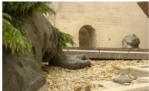
Disaster in the Ancient City sculpture at the Nanjing Massacre Memorial Hall