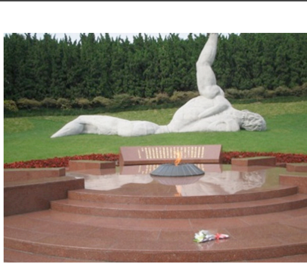
Sculpture of the Unknown Martyr at the Longhua Martrys Memorial Park, Shanghai

The Memorial to Victims of the Nanjing Massacre by the Japanese Army Invaders should be understood in the larger context of post-Mao liberalization and the emergence of new narratives of national identity and nationalism. The idea for a museum dedicated to the Nanjing Massacre dates back to 1983 and was clearly the result of interest in the topic at the highest levels of state government. 25 Qi Kang, a Nanjing-based architect who has made a name for himself designing museums and memorials, was the principal designer of the site. The first part of the museum was completed in 1985 and included the main exhibition hall and the “graveyard grounds.” 26 In 1995, the site was expanded to include a new L-shaped entranceway that created a southern-facing gate and added several impressive sculptures. The site underwent a $59 million expansion in 2007 to commemorate the seventieth anniversary of the massacre. The expansion included a new exhibition hall, a grand new entranceway, and a peace garden (Kingston 2008). My analysis in what follows is based primarily on visits made to the site in 2004–2006, before the 2007 expansion,