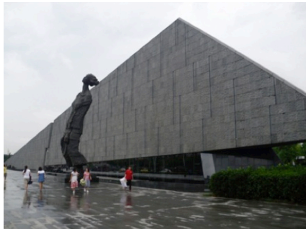
Sculpture walkway and the new exhibition hall at the renovated Nanjing Massacre Memorial Hall.

prominently broken and cracked walls, mother-child imagery, and the number 300,000 33 —but they also altered the contemplative nature of Qi Kang's original design, which had already been undermined by the 1995 renovations and additions. The 2007 renovation, by adding an additional 20,000 square meters to the previous space, making the total area 74,000 square meters, gave the site a grandeur and monumentality it never had before. Whereas the original site was barely visible from the street, the 2007 renovation gave it a much more prominent street presence. The facade of the new exhibition hall now faces the street and forms a kind of walkway that leads to the main entrance. The walkway is referred to as the sculpture plaza and is lined by a reflecting pool dotted with sculptures of victims. Some of the sculptures depict victims fleeing the invading Japanese troops, but the most prominent—it dwarfs the others and is nearly as tall as the wall of the exhibition hall that serves as its backdrop—shows a mother carrying the limp and lifeless body of her child. 34 The sculpture, which alludes to similar images inside the site, sets the moral tone by emphasizing the breaking of the bond between mother and child.