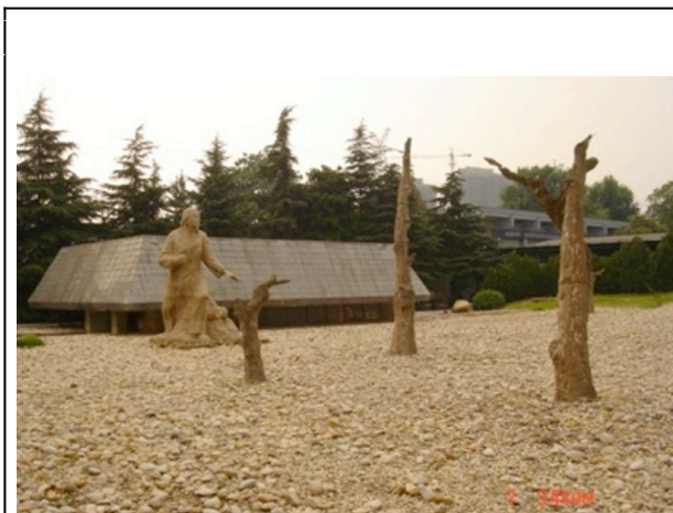
Statue of a mother searching for her child in the graveyard ground part of the

elbow-shaped passageway formed by cinderblock walls to each side. At the end of the enclosed passageway, a vista slowly opens to reveal a landscape of scorched pebbles interrupted only by a few leafless trees and the statue of a mother who appears to be searching for her child. 29 A statue of a mother holding a child figures prominently at the Hiroshima Peace Memorial Park in Japan and another, called War Widow With Children , is in the courtyard at Yasukuni Shrine. Qi Kang may be responding to these Japanese memorials, but the trope of mother and child has long figured prominently in leftist artistic discourse, both in the West and China. 30 Along the edge of the field of stones, the visitor follows a long stone relief, which forms a wall between the graveyard and the city, depicting moments of horror suffered by Nanjing residents during the massacre. After a memorial wall inscribed with names of victims, the path then leads through two separate “bones” rooms— exhibits of the bones of massacred victims found on the site. With its open space and relative absence of explicit signifiers, the graveyard grounds is the most contemplative and humanist section of the site. Rather than direct the spectator’s ire at a specific agent of atrocity, it provokes a more generalized feeling of the endemic nature of human cruelty and suffering.