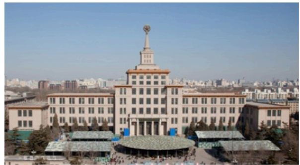
Figure 1. The Military Museum, one of several major museums built during the Great Leap Forward.

When the CCP came to power in 1949, it proceeded to nationalize all culture industries and cultural institutions, including museums, and to develop them in ways that would align them with the new ideology of state socialism. National, provincial, and local governments promoted, funded, and constructed many new museums. Not long after the liberation of Beijing, the Central Committee sought to establish a Museum of the Chinese Revolution to present an official view of party history, and in the early 1950s, the state started building memorial halls dedicated to sites of significance to revolutionary history, to important revolutionary leaders, and to cultural figures such as the writer Lu Xun. In terms of exhibitionary style, the types of museums built, and the veneration of revolutionary heritage, these early PRC museums were deeply indebted to the Soviet influence. 1 It was not until the Great Leap Forward that a more systematic state effort to build museums was instituted. In general, it is useful to see museum development in the PRC as occurring in three dynamic bursts: the Great Leap Forward (1958-1962), the early post-Mao period (1980s), and the post-Tiananmen period (1990s- present).