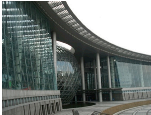
The Shanghai Science and Technology Museum

the future, a future that is technologically modern and culturally civilized.