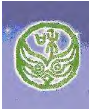
The Symposium Logo

During the preparatory stage of the symposium, all these aspects of the understanding and usage of wakai were extensively debated. The discussion became quite significant while deciding on the logo of the symposium. The initial logo was composed of the character "wa" and an owl, which in Ainu culture is the guardian deity of a village. Concerns were raised about the connotations of the character "wa" and its use within the rhetoric of Japanese imperialism. However, since the character is part of both the words 'reconciliation' and 'peace' ( heiwa ), it was already very 'visible' in the symposium's title. A compromise was reached by using an old-style Chinese form that minimized the association with Japanese imperialism.