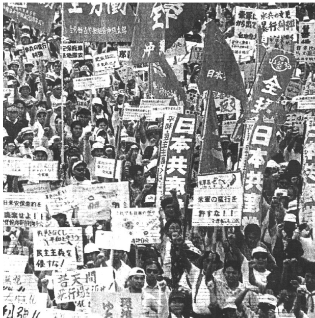
October 22, 1995 protest march and rally

threatened the fabric of Okinawa as a joint US-Japan “base island.” That meeting brought more Okinawans together than ever before or since, and it stirred the two governments to agree between themselves that the bases had to be reduced and Futenma returned. Eleven years on, that promise is nowhere in implementation. The emptiness of the 1996 promise is itself cause for Okinawan distrust.