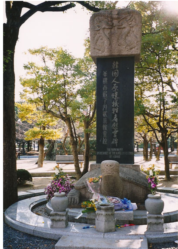
Memorial for the Korean victims of atomic bombing in Hiroshima

in the womb. Hibakusha are not only Japanese → there were also Koreans and Chinese forced laborers (kyosei renko) as well as allied POWs.