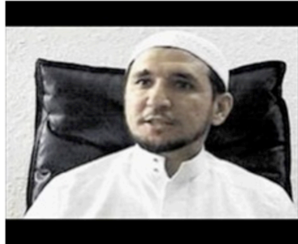
Mohammed Jamal Khalifa

It seems clear that the 1980s official USG block against antiterrorism actions that might embarrass the Saudis was still in force in America in 1995. We see this in the extraordinary federal protection extended to Mohamed Jamal Khalifa, Osama bin Laden's best friend and brother-in-law.