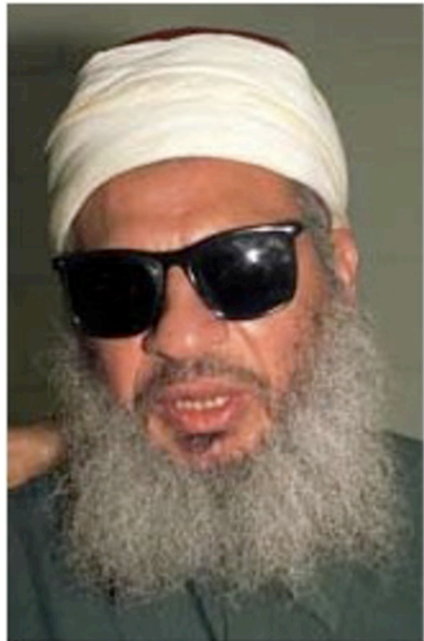
Sheik Omar Abdel Rahman

The CIA may have wanted to think that the Al-Kifah training was only for Afghanistan. But the blind Sheikh Omar Abdel Rahman, the mentor of the Center whom the CIA brought to America in 1990, was preaching for the killing of Jews and also for the destruction of the West. 35 His preachings guided Mohamed's Makhtab trainees: as a first step, in November 1990, three of them conspired to kill Meir Kahane, the founder of the Jewish Defense League.