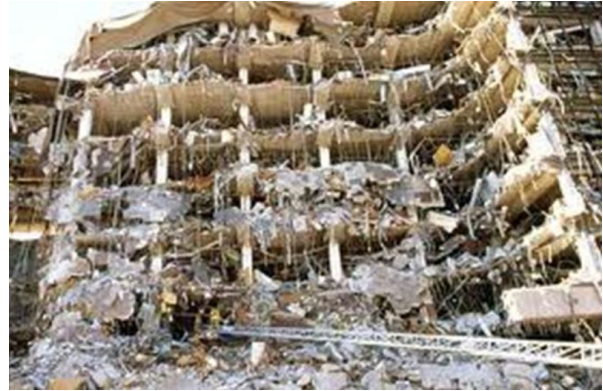
On April 19, 1995, the Alfred P. Murrah Federal Building was bombed, killing 168 and injuring 800.

But the most striking parallel between these two cases of terrorism is the incalculable harm done to innocent victims. These were attempts to kill randomly and on a grand scale, and in an awful way they succeeded.