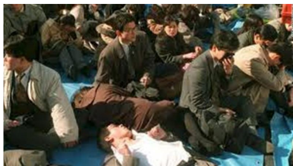
The scene outside a Tokyo subway after the sarin gas attack of March 20, 1995, which killed 13 and injured 6300.