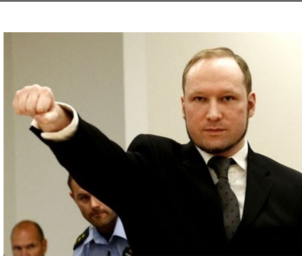
Breivik in Oslo courtroom after sentencing.