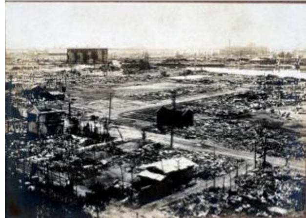
Earthquake destruction in Yokohama