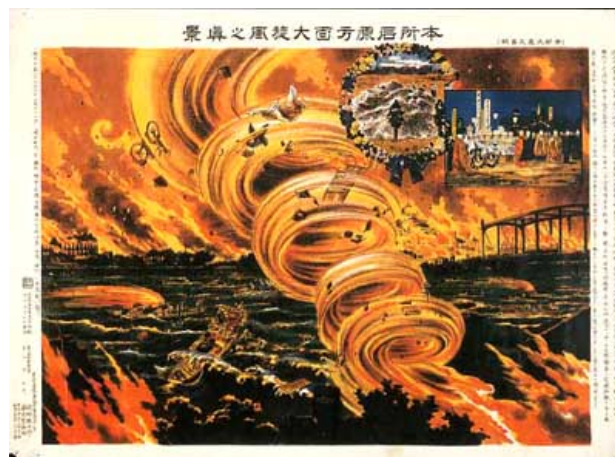
Sketch of a giant whirlwind toward Hongo-Ishihara