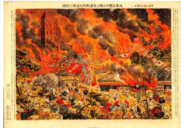
Fire spreading to the twelve-story tower in Asakusa Park and Hanayashiki Amusement Grounds, Tokyo

September 1, 1923, 11:58 a.m. The earthquake of magnitude 7.9 violently shook the Kanto region encompassing Tokyo, Kanagawa, Saitama, Chiba, and other prefectures. That day a total of 114 tremors were felt. In Tokyo alone, 187 major fires broke out, quickly wrapping the metropolis in flames, burning down homes, industrial facilities, and public infrastructure. The death toll reportedly exceeded 100,000. This was the Great Kanto Earthquake of 1923, the most dreaded memory of natural disaster of its kind in Japan to this date, far surpassing in its destructive power the January 1995 Great Hanshin-Awaji Earthquake that struck the Kobe region.