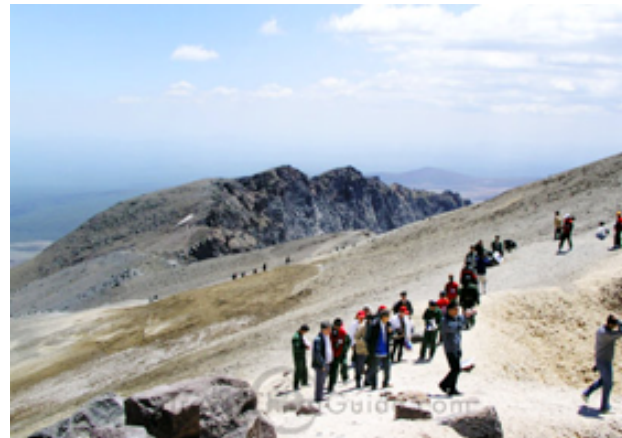
Tourists on Mount Changbai, Jilin

million ethnic Korean minority, including the Yanbian Korean Autonomous Prefecture. Bolstering the economy through tourism is a means to jumpstart the economy of a region on the China-Korea border. The implications include strengthening loyalty to China among the Korean minority, a particularly important factor in the event either of a North Korean meltdown or significant steps toward Korean unity and reunification. The concern of China's Central Government relates both to the consequences of a possible future reunification and the present situation in the border area around the mountain where large numbers of North Korean refugees are living, and where the potential exists for territorial boundary disputes. Pan-nationalistic activities by South Koreans aimed at creating a united Great Korea, including Yanbian, a Chinese prefecture, have intensified China's concerns. (6)