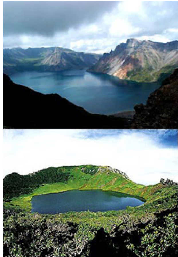
Lake Chonji/Tianchi (Heavenly Lake) at the Paekdu/Changbai peak (above), and Mount Halla (below)

Why have Korean nationalists been so outraged over China’s recent actions? What does Mount Paekdu mean for them? Koreans consider Paekdu, the highest mountain on the Korean Peninsular and in China’s Northeast, to be the ancestral birthplace of their people. The mythical founder of Korea, Tan’gun, is said to have been born here, making Mount Paekdu the site of the Korean national foundation myth. In short, Mount Paekdu is a Korean holy site that is emblematic of the “national spirit”. Thus, China’s claim of Paekdu is interpreted as laying claim to Korea’s ancestry.(24) The geobody of the Korean Peninsula is represented as ranging “from Halla to Paekdu”, two mountains which span the peninsula. Mt. Paekdu is located on the border with China and Mt. Halla is located on Cheju, an island off the southernmost tip of the peninsula. Mount Paekdu appears in the beginning of the South Korean national anthem, “Aegukka” (Song for Love of Country): “Until the East Sea’s waves are dry, and Mt. Paekdu is worn away, God will watch over our land forever! Our country forever!” These points illustrate the overriding cultural and historical significance of Paekdu in Korea.