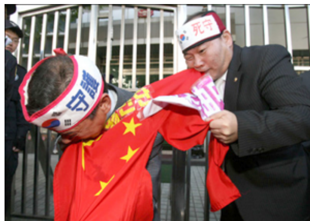
Outraged South Korean protestors against China's claim of Mount Paekdu chew on a Chinese flag.

Some South Korean nationalist groups argue that recent activities on the Chinese side of the border amount to preemptive Chinese claims to the whole mountain as Chinese territory. One significant protest took place during the 2007 Asian Winter Games, which were held in Changchun, in China's northeast. A group of victorious South Korean women athletes held up hand-printed signs during the award ceremony on January 31, 2007, which proclaimed in Korean "Mount Paekdu is our territory". Chinese netizens immediately denounced the athletes and released a parody picture on the internet, in which the athletes claim "Mars is our territory" (17) (Picture 6) Chinese sports officials responded that this was a "politically-motivated banner that undermines China's territorial sovereignty", and delivered a letter of protest stating that political activities violated the spirit of the Olympics and were banned in the charter of the International Olympic Committee and the Olympic Council of Asia. The head of the Korea Olympic Committee responded by stating that the incident was unplanned and held no political meaning. (18)