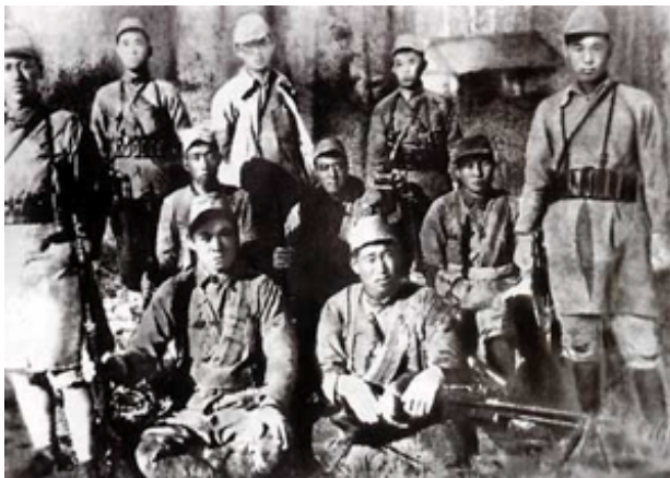
Kim Il Sung (middle, back row) with soldiers of the Anti-Japanese Army in Manchuria in a 1937 photo.

The 2000 edition of the magazine Democratic People's Republic of Korea describes Paekdu as "the ancestral mountain...the symbol of Korea and the cradle of Korea... In Paekdu forests the Great Leader Kim Il Sung mapped out the great plan to liberate Korea... and led the arduous and glorious anti-Japanese resistance.... Kim Jong Il grew up there as the 'son of Mt Paekdu', 'son of guerrillas', hearing the sound of guns in the flames of the anti-Japanese revolution as if a lullaby..."(27) Thus, Paekdu is glorified as the holy place for revolution and as the key base for Kim Il Sung's anti-Japanese guerrilla struggle in the 1930s. Paekdu also locates Kim Jong Il on the continuum of anti-colonial guerrillas with his father. The façade of the Korean Museum of the Revolution in