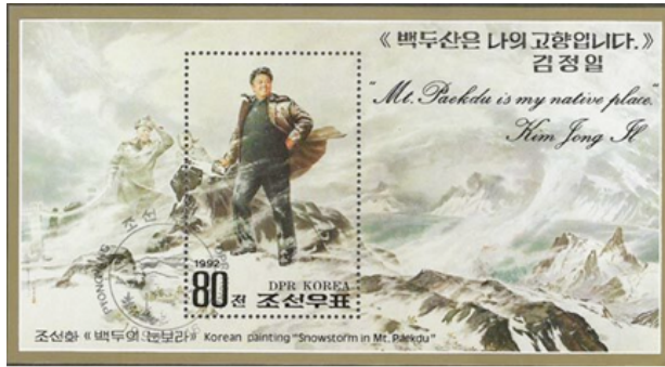
North Korean souvenir stamp issued in 1992 shows Kim Jong Il braving the elements in a winter landscape of Paekdu Mountain.