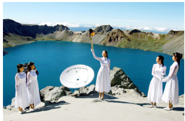
Chinese students perform a torch-lighting ceremony for the 2007 Asian Winter Games at Lake Tianchi/Chonji (Heavenly Lake) on top of Changbai/Paekdu Mountain

and the two Koreas. The Asia Winter Games' official song includes a paean to Changbai. The pressroom for the Games at Changchun in February 2007 provided pamphlets on Changbai Mount.(3) All these activities lay foundations for claims that the landmark is Chinese.