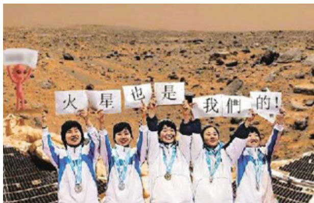
A Chinese netizen's parody mocking the South Korean medalists' claim to Paekdu. It reads "Mars is our territory."

The Paekdu controversy has reignited the China-Korea "history wars" which have raged for five years over the ancient kingdom of Koguryo (Korean)/ Gaogouli (Chinese) (37 B.C. to A.D. 668). As the Paekdu mountain range is located in the old territory of Koguryo and furthermore, Koguryo also considered the mountain sacred, China's claim is deemed tantamount to claiming the ancient kingdom as Chinese territory. Thus, the Paekdu issue relates to the ongoing Koguryo dispute. South Korea's Donga Daily criticized China's recent move, calling it the "Mt. Paekdu Project" and interpreting it as a bid to retrospectively incorporate the territory of Koguryo into Chinese history and territory. (19) In short, the recent "Mount Paekdu Project" is viewed by South Korean nationalists as integral to the