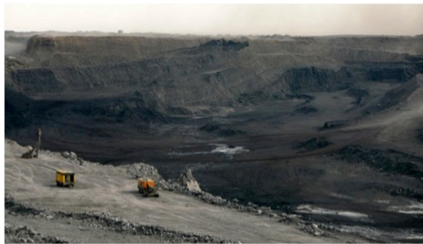
Tavan Tolgoi (Five Hill)

The uncertain progress of the Tavan Tolgoi project illustrates the headaches facing Mongolia as it tries to reap its resource bonanza on behalf of its citizens even as the remorseless economic logic of globalization demands marginalization of their interests. Tavan Tolgoi, in the Gobi Desert less than 300 kilometers from the Chinese border, contains over six billion tons of coal reserves, including 1.8 billion tons of coking coal, a premium and profitable item used in the iron and steel industry.