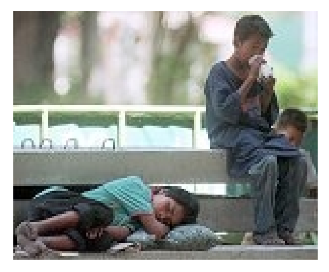
At-risk street children in Bangkok

I vividly recall a conversation with a senior Thai monk during the 2001 conference of the International Association of Buddhist Studies in Bangkok. I asked the Venerable, "Why don't Thai Buddhist leaders speak out against the rampant sexual slavery imposed on children in Bangkok and other Thai cities?" He replied, "You must understand that these girls did something evil in their past lives, perhaps committing adultery. That is why they ended up as prostitutes in this life. Of course, there is hope for them in their future lives."