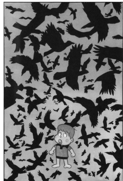
The Red sky and crows © Akatsuka Fujio

When I saw the book, it was like a bolt of lightning. I felt intuitively that we could make use of it to communicate the Japanese experience to the Chinese people. First of all, I wanted to translate it and get it published in China. Everyone in the Japanese Foreign Ministry and every China expert I talked to said it couldn't be done, but I figured nothing ventured, nothing gained. I inquired at four top publishing companies in China, but they all turned me down. "The Party will never allow it," they said. "Even if we published it, no one would buy it." Of course, I had never thought of it as something with real market potential. I just thought if we could only get a Chinese edition out in book form, somebody was bound to read it, and that could set something in motion.