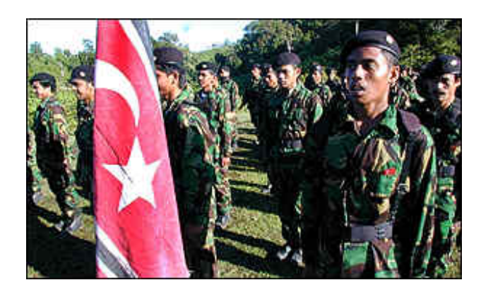
The rebels of Free Aceh Movement are fighting for an independent Islamic state from Indonesia.

guerilla war for Acehnese independence from Indonesia. However, even though GAM members have been known to engage in kidnappings, particularly of Indonesian businessmen, on land, it seems unlikely that the organization on a central level would endorse piratical activity. The strategy of the GAM leaders, most of whom live in exile in Sweden, has been to try to gain the sympathy of the international community for Acehnese independence, and engaging in piracy would be clearly detrimental to this objective, especially against the background of much speculation about a possible connection between piracy and the threat of maritime terrorism in the wake of the 11 September 2001 terrorist attacks in the United States. This said, however, it is possible that some local bands of GAM sympathisers may use piracy as a means of fund-raising although it is equally possible that it is the work of politically non-committed bandits in the region.