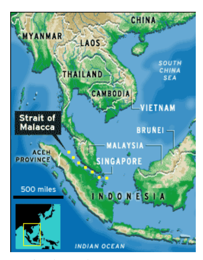
Map of South East Asia

valuables such as watches, jewellery and electronics. These pirates generally avoid violence unless resisted and leave the ship with their loot within 15 to 20 minutes.