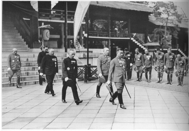
Emperor paying tribute at Yasukuni, 1935

died, and compiled a list of eligible dead (to be eligible, one needed to have died in battle, or from wounds or sickness suffered while on active duty); (2) the list of names was presented to the Emperor for final approval; (3) enshrinement took place at Yasukuni at the shokon ceremony preceding the biannual shrine festivals.