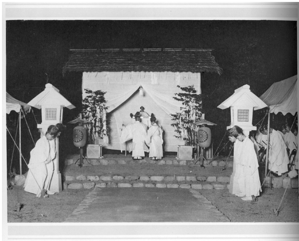
Head priest calling in the spirits of war dead at shokon ceremony, 1935

Only a fraction of the war dead were enshrined in this way, however. Of the 2,342,341 that were enshrined at Yasukuni for sacrificing their lives in the conflict that lasted from September 1931 to August 1945, only 251,135 enshrinements were completed by April 1945, the last ceremony before the end of the war. In