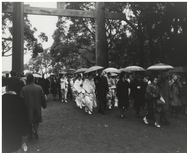
Yasukuni Shrine visit at the New Year in the early postwar years

This article examines the role of military, emperor and government in the enshrinement of Japan's war dead from 1868 to 2007. Below also find an Asahi Shimbun editorial reflecting on the constitutional and political issues of enshrinement.