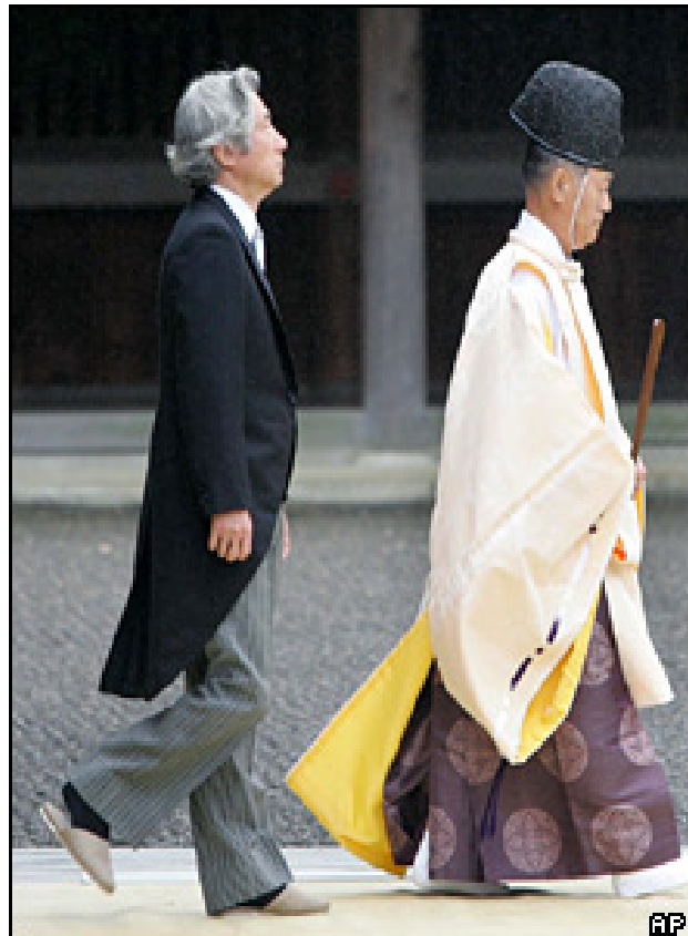
Koizumi visits Yasukuni, August 15, 2006

Between 2002 and 2006, Prime Minister Koizumi Jun'ichiro repeatedly visited the shrine in the face of domestic and international protests, ultimately provoking multiple lawsuits in Japan and severely straining Japan's relations with China and Korea.