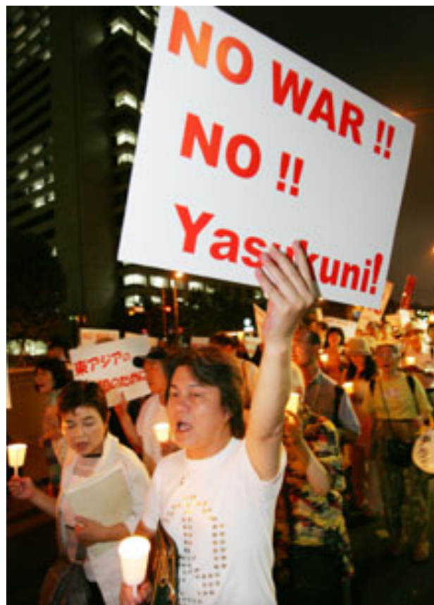
Demonstrators hold candlelight vigil outside Yasukuni, August 11, 2006

Koizumi's visits prompted several Diet members to ask the National Diet Library, which serves as a research organ for the Japanese Diet, to compile material concerning postwar interaction between the Health and Welfare Ministry and Yasukuni Shrine. Among 808 new documents released, 179 had previously been held by the shrine and 94 by the former Health and Welfare Ministry. To better understand the role of the Health and Welfare Ministry, particularly its War Victims' Relief Bureau, in the enshrinement, it is helpful to review the changes in Yasukuni enshrinement procedures made following the Asia-Pacific War.