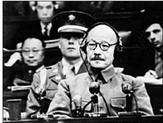
Tojo on trial

Attempts made to solve the controversies surrounding Yasukuni Shrine include proposals to remove the names of the seven war criminals that were executed in 1948 (the issue of Class-B and -C war criminals was not addressed) and calls to build a new non-religious national memorial. The former stalled when the family of former Prime Minister Tojo Hideki refused to sign a petition – previously signed by family members of the other six – to remove the seven names from Yasukuni. The shrine, too, has vehemently opposed the removal, explaining that, unlike an ordinary shrine, where each god has its own seat ( za ), Yasukuni gods all occupy a single seat. Therefore, it is impossible to separate one from another once enshrined.