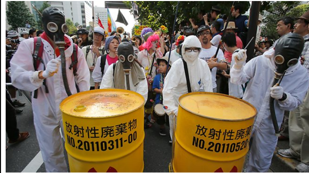
Anti-nuclear protesters, wearing gas-masks, beat metal drums as they march near Japan's Parliament in Tokyo on July 29.

In a series of editorials in the Asahi, Oguma addressed readers more directly. On March 9, 2012, he exhorted his readers to “think for themselves” in deciding whether nuclear power is appropriate for Japan, pointing out the importance of an informed citizenry and the possibility of protest as a viable and even necessary tool of social change, albeit, one that requires more of each individual than they are used to giving. On May 9, 2012, he points to the impossibly high economic and social costs required to somehow minimize or even manage the risk that nuclear power poses to society and humanity. Oguma points to the need for “courage” in facing up to entrenched interests of banks and insurance companies, corporations and bureaucrats, in a Japanese state that is still authoritarian, even in dysfunction.