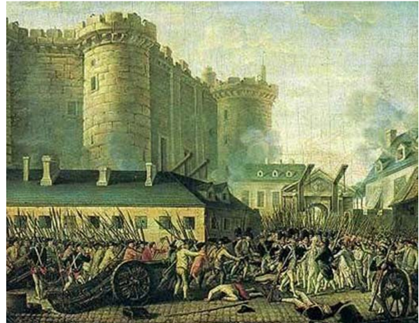
Attacking the Bastille

A: I recalled the diary of Louis XVI during the French Revolution. On the day a mob attacked the Bastille, the king wrote in his diary that nothing happened. Because he went hunting almost daily, the entry meant that he didn't catch anything. There was no recognition that society was being shaken from its very roots.