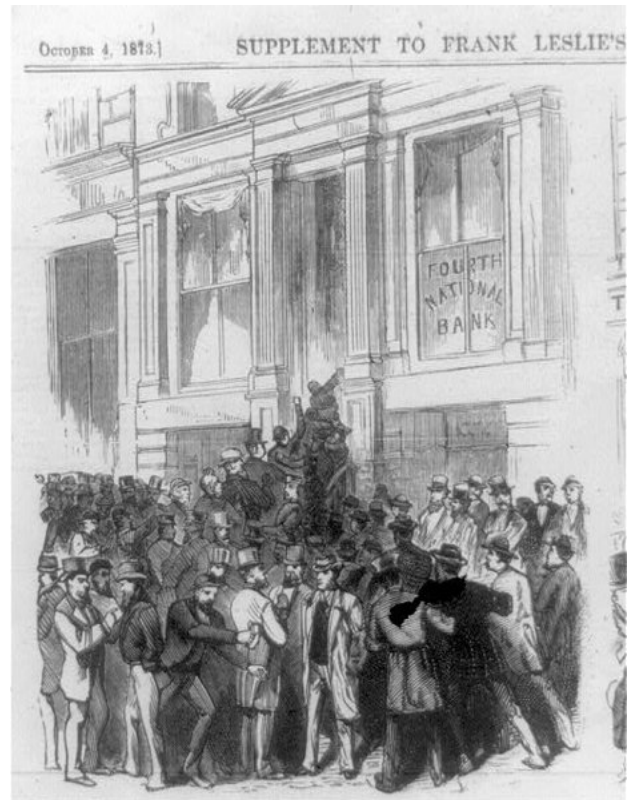
Bank run of 1873

The boardrooms and finance ministries of Seoul, Bangkok, Jakarta and Kuala Lumpur are today filled with a fair degree of schadenfreude at America's troubles. Schadenfreude is not a very nice emotion; Theodor Adorno once defined it as "unanticipated delight in the sufferings of another." But asking Asia's business and governing elites to repress shivers of pleasure at the meltdown of the American financial system is probably demanding more than flesh and blood can bear. The spectacle of the politicians, pundits and academics of Washington and Chicago thrashing about in attempts to justify the vast amounts of money being shoveled at their, um, cronies on Wall Street is just a little too rich. Particularly since much of the money will have to be borrowed from the very people who a decade ago at the time of the so-called Asian Financial Crisis were being pooh-poohed for their "crony capitalism," "opaque" banking systems, "incestuous" government-business relations, not to mention their supposed absence of transparent financial reporting, good corporate governance, or accountable executives and regulators.