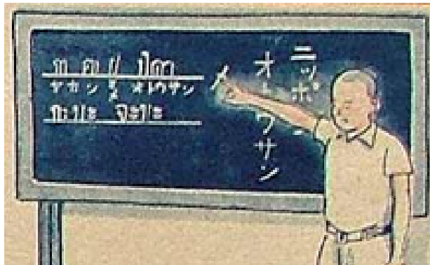
[Behind teacher's arm:] Japan, father

Let's make the culture of Greater East Asia flourish more and more. In order that the peoples of Greater East Asia can communicate with each other, let's learn Japanese.