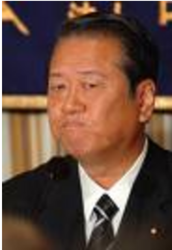
Minshuto Secretary-General Ozawa

Why? Because the Japanese bureaucratic system does not only have ancient built-in defenses, it has something akin to an immune system. We need to take a step back to see this in perspective. All countries have a concrete power system that is different from their theoretical one. All countries live with political honne and tatemae . The substantial system of power exists, as it were, inside the official political system that is described and regulated by such things as the constitution. The informal, unofficial, substantial system of power relations may change and drift farther away from what it should be in principle. The past decade of American political history provides a perfect example of that: power arrangements centered on the military-industrial complex and huge financial and insurance firms are stronger than the causes