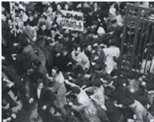
Tokyo University students mobilize to oppose the purge

From the start of 1950, the Red Purge by private corporations moved forward apace with the backing of GHQ. Macarthur's letter of July 18 to Prime Minister Yoshida Shigeru led the way. The letter directly orders suspended publication of the central organ of the Japanese Communist Party, Akahata (Red Flag), along with publication of any successor newspaper. This letter became the sole legal basis for the red purge in the media. The GHQ authorities insisted that the letter took precedence over all other laws and that its instructions constituted a 'directive' (shiji) rather than an 'order' (shirei).