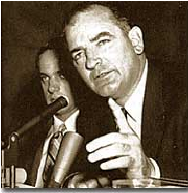
Joseph McCarthy and Chief Counsel Roy Cohn

This graphic example of U.S.-style “democracy” in action has had a lasting legacy in Japan, albeit a somewhat ironic one. It fractured an already highly factionalized Left. It strengthened the foundations of what would turn out to be an enduring “one-and-one-half-party” democracy, dominated by slavishly pro-American conservatives. And it made a mockery of rule of law (just as U.S.-endorsed remilitarization under the clearly anti-military Constitution would continue to do to the present day).