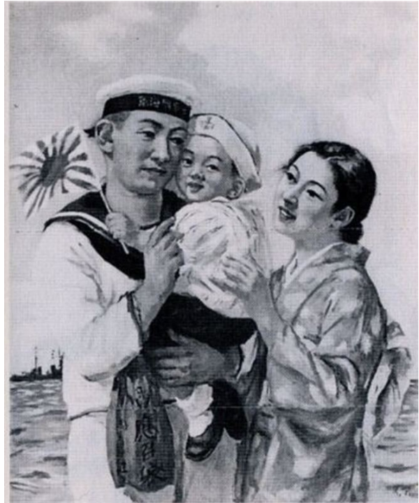
Figure 13 Shufu no Tomo (主婦の友), September 1941

There is abundant evidence to show that the Japanese media lacks a critical stance towards these politicized gender representations. Figures 11, 12, 14, and 15 are photographs that appeared in morning newspapers on February 6, 2005, when the fifth SDF force was dispatched to Iraq. On that day, about 200 soldiers left for Iraq and 500 family members saw them off. Interestingly, news reporters from several different newspapers chose the same two subjects in their depictions of the event.