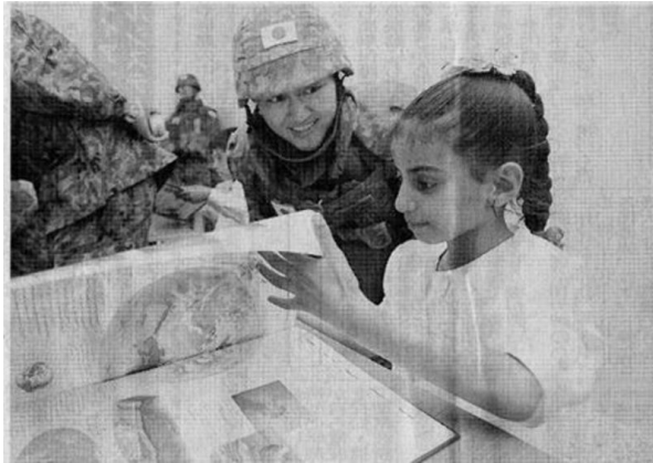
Figure 10 A female SDF official and an Iraqi girl

In the UN Mission of Support to East Timor (UNMISET) of 2002, female SDF officials were included as peacekeepers for the first time. Since then, the participation of female service members in UN peacekeeping operations has become commonplace. In addition, when the Japanese government supported the U.S.-led war effort by sending the SDF to help rebuild war-ravaged Iraq in 2004, each 100 person-unit included approximately ten female members working in communications, supply and nursing positions. When the Japanese government declared the southern Iraq city Samawa a noncombat area and dispatched the SDF there, female officials were included in the first group.