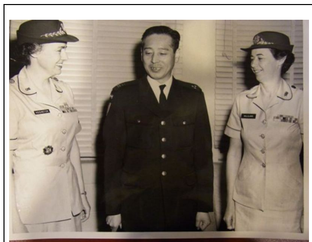
Figure 3 Col. Tanaka Shoji's visit to the U.S. Women's Army Corps Center 42

However, other forces would affect the gendered formation of the military. As Sasson-Levy points out, "globalization processes have served as catalysts for change and development in gender relations in many militaries around the world, especially in Western militaries." 37 Since militaries examine situations internationally and emulate each other, especially the world's dominant ones, they tend to become similar to one another. 38 Needless to say, the U.S. military has strongly influenced all other militaries. Japan is among the loyal students influenced by the gendered structure of the U.S. military at the time, taking it as a model in certain respects for the SDF.