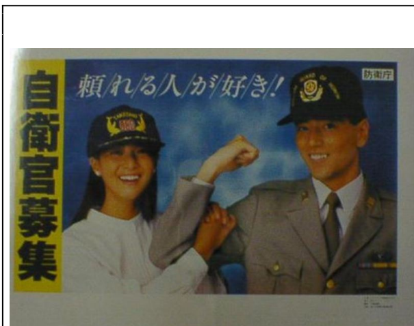
Figure 9 SDF recruiting poster, 1987

It is striking that even many leading officials and Diet members who tried to open the door for women in the SDF justified the change in traditional terms. For example, Suzuki Muneo, then a member of the Liberal Democratic Party (LDP), expressed this view of women's incorporation into the NDA at a cabinet committee of the House of Representatives in 1990: