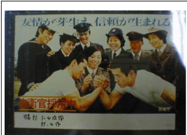
Figure 5 SDF recruiting poster, 1976

Since their introduction into the SDF, a substantial number of women have served in the recruitment division. The recruitment strategy in Okinawa, a location with an overwhelming U.S. military base presence, illustrates the SDF's approach to combating negative public sentiments. After Okinawa's sovereignty was transferred from the U.S. to Japan in 1972, a female official was included in Okinawa's recruitment division in an effort to mitigate Okinawan antipathy towards the SDF.