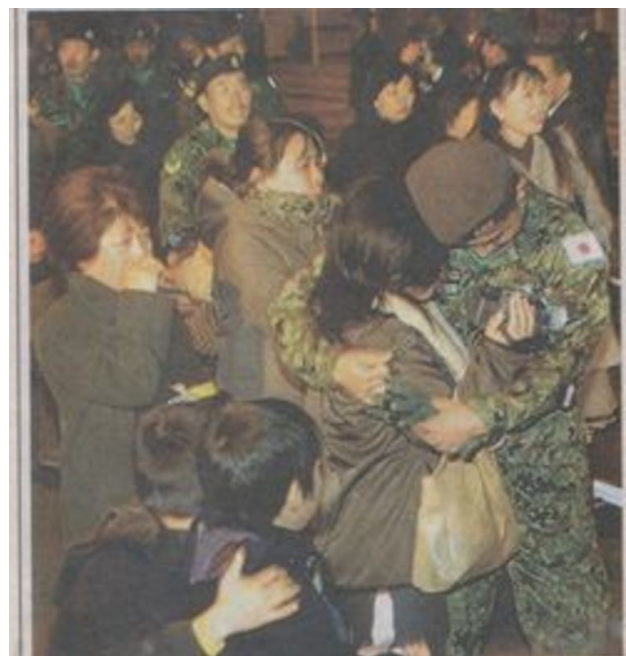
Figure 15 Chunichi Shimbun (中日新聞), February 6, 2005

What propelled this change in policy? One factor is the need to recruit SDF personnel in the era of a declining birthrate and aging population. Another factor is globally-promoted gender mainstreaming. UN Security Council Resolution 1325, adopted on October 31, 2000, recognizes women’s roles and experiences in peace building and conflict resolution. It also calls on UN member states to increase