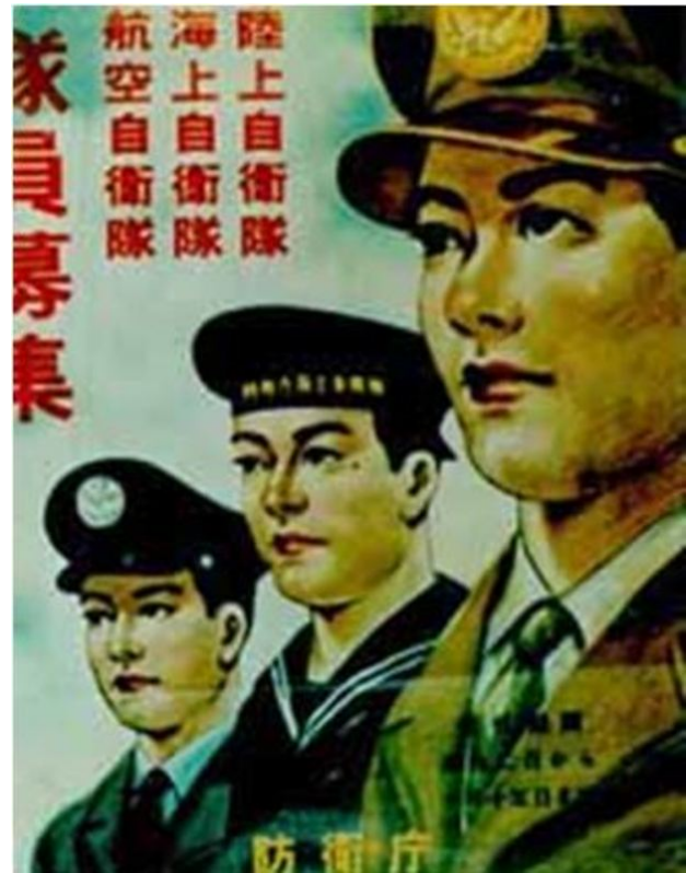
Figure 7 SDF recruiting poster