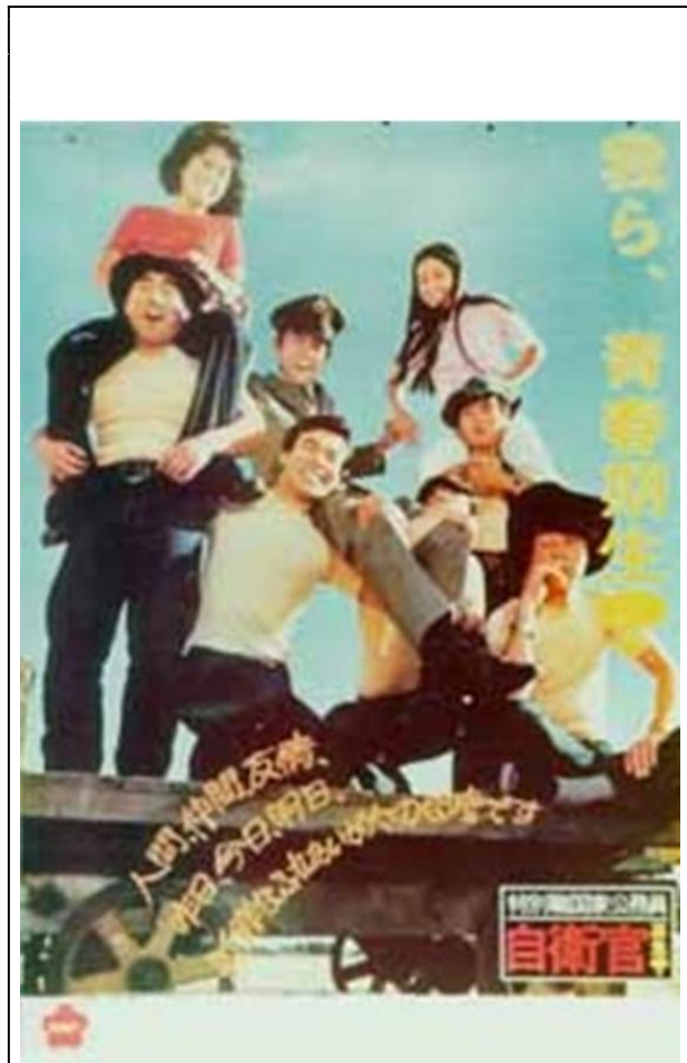
Figure 6 SDF recruiting poster, 1973

uniform. Accompanied by the slogan "Friendship develops, trust is born," the close groupings testify to the close and warm relations between the SDF members and civilians. Figure 6 is a 1973 SDF recruiting poster. A male SDF official is shown in the center, surrounded by young civilian friends, five men and two women.