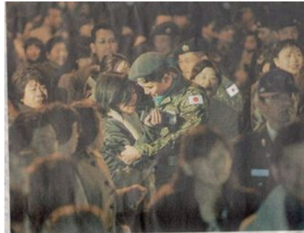
Figure 14 Asahi Shimbun (朝日新聞), February 6, 2005

Change in civil society had a ripple effect leading to changes in the SDF. At the same time, the Japanese government has been promoting gender integration of the SDF. The government upgraded the Defense Agency to the Defense Ministry in 2007. In the same year, women’s job limitations were revised, and in 2009, some positions, including serving on escort vessels and patrol helicopters, were opened to women. 68 Moreover, the Ministry of Defense began to lay down the infrastructure for maintaining a work-life balance that would facilitate women’s participation in the SDF, such as providing for a workplace nursery in some units. 69