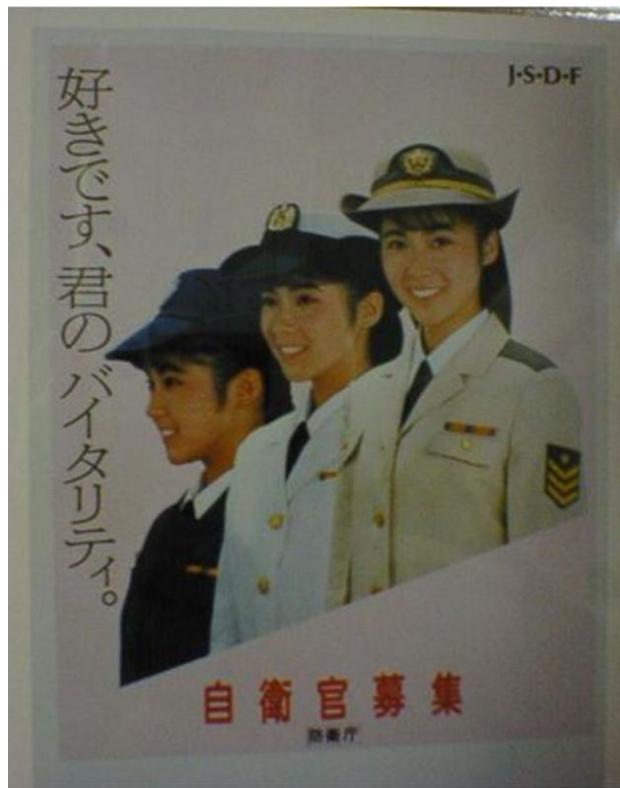
1954 Figure 8 SDF recruiting poster, 1989

In 1992, the Japanese government for the first time admitted women as cadets into the National Defense Academy (NDA). This was designed to give women the opportunity to gain promotions to senior officer ranks. Thus, the possibility that women would become officers and decision makers increased. Yet even when a small number of women were admitted as elite cadets into the NDA, there remained continuity in the use of women's presence and images for recruiting purposes (See Figures 1 and 2).