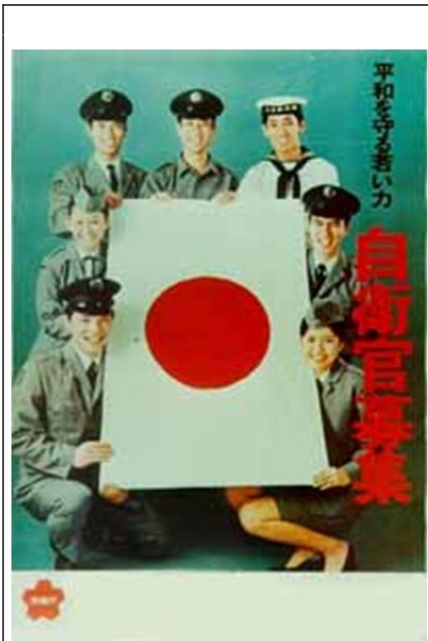
Figure 4 SDF recruiting poster, 1971

If the SDF admits women, we could gain more supporters. This is because if one woman decides to become an SDF member, she would have to persuade everyone in her family. Moreover, such a woman with a healthy spirit would bear children who would become soldiers. 49