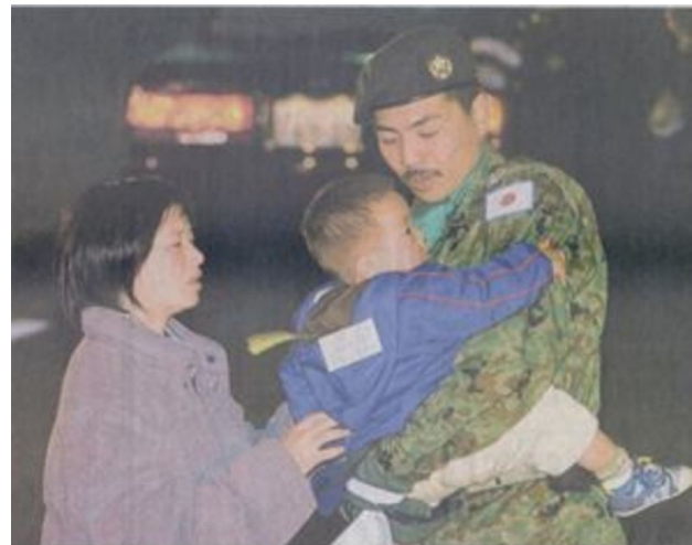
Figure 11 Mainichi Shimbun (毎日新聞), February 6, 2005

most SDF officials. 66 In the photo, a female SDF member smiles at an Iraqi girl who has just opened a book that was given to her. What message does this photo communicate? It shows Iraq as a non-dangerous combat area where local people welcome the SDF and the SDF fosters Iraqi education. The inclusion of female members in the troop is intended to persuade skeptical Japanese people to view Samawa as a noncombat area and the Iraq mission as a benevolent peace operation. If Samawa is a dangerous combat area and the Iraq mission is to wage war, after all, who would send women there? Thus, women’s representation was used to camouflage Samawa as a combat area and the nature of the SDF’s mission in Iraq.