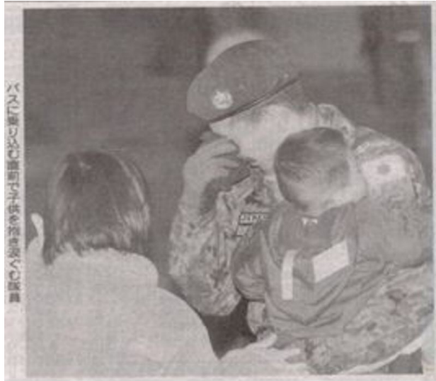
Figure 12 Yomiuri Shimbun (読売新聞), February 6, 2005

There is abundant evidence to show that the Japanese media lacks a critical stance towards these politicized gender representations. Figures 11, 12, 14, and 15 are photographs that appeared in morning newspapers on February 6, 2005, when the fifth SDF force was dispatched to Iraq. On that day, about 200 soldiers left for Iraq and 500 family members saw them off. Interestingly, news reporters from several different newspapers chose the same two subjects in their depictions of the event.