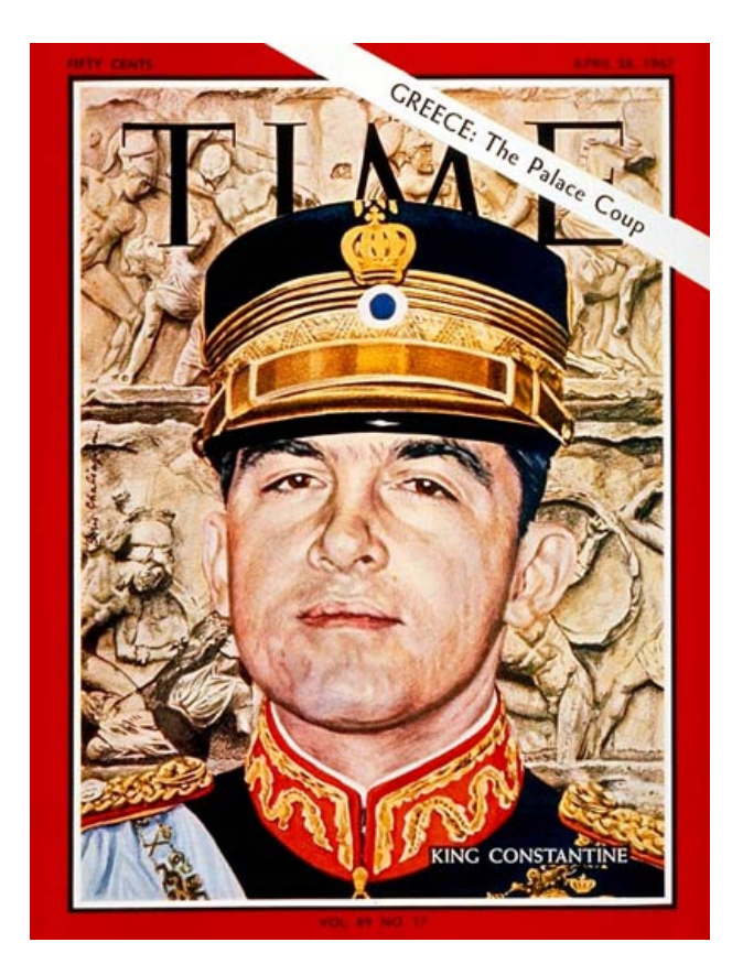
King Constantine, 1967

The state awarded the ex-king 4 million Euros in compensation for his 550 million Euros in confiscated assets. Constantine still refuses to recognize the Greek republic, is banned from owning a passport and has become a figure of ridicule. Many public figures openly mock him, calling him the 'half-wit king' and "o Teos" ("the former").