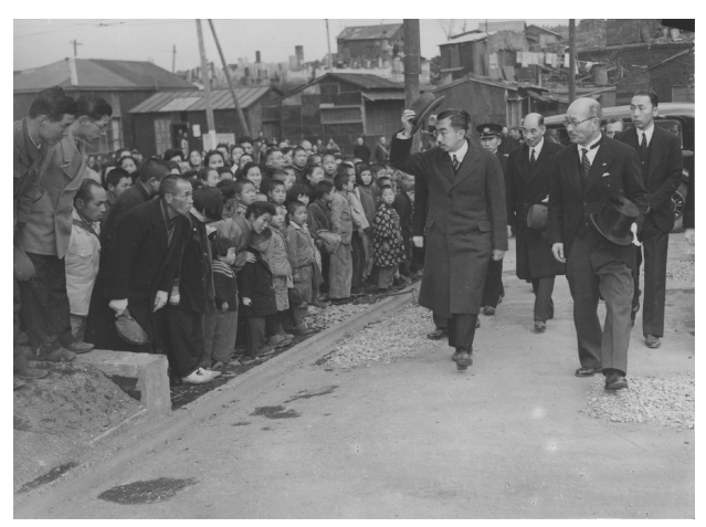
Emperor Hirohito going to the people, 1946