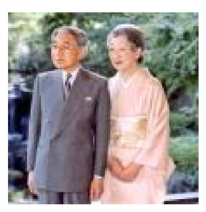
Emperor and Empress: Formal portrait

Was this precaution necessary? Everything, from my query, submitted weeks in advance, to his majesty's written reply had been carefully scripted and vetted by IHA bureaucrats. The whole episode capped to us foreign observers a slightly farcical 60 minutes: journalists asking mostly anodyne questions about their majesties' health and their impressions of Ireland and Norway before wishing them a safe trip; the sight of 40 heads leaning forward to catch the Empresses' whispered replies, which could hardly be heard by anyone in the room.