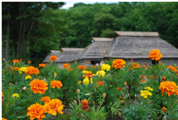
Chise, Ainu home

Chiri Yukie's book contains thirteen songs of gods such as the owl, fox, rabbit, little wolf, sea, frog, otter, and swamp mussel deities, and the spirit of the damp ground. "Silver Droplets Fall" is the first of her collection, and one of the two owl god songs. The owl (or more precisely, in Horobetsu, Blakiston's eagle-owl) is kotan-kor-kamuy , the guardian god of the kotan (hamlet).