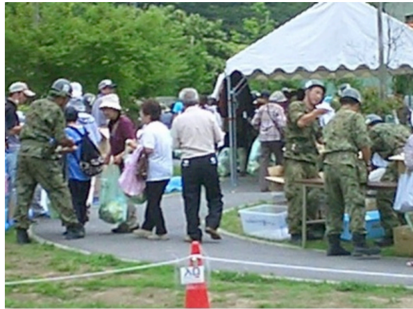
Japan Self Defense Force (JSDF) providing relief for disaster survivors, Miyagi Prefecture, Japan, July, 2012

But in the course of my visit and interviews, it was impossible to avoid noting numerous shortfalls in the disaster response.