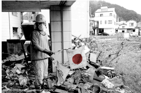
A volunteer holds up a flag found in the rubble of Kamaishi City.

items such as food were turned away by the government at the very time when many survivors were desperately in need. On the other hand, unneeded donations poured into some areas, resulting in oversupplies of food and medicine in some locales while others faced severe shortages.