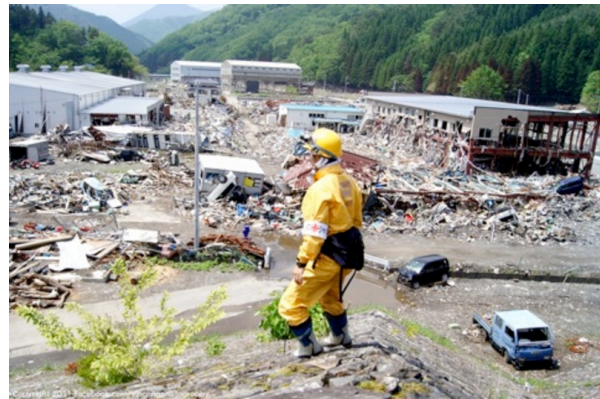
Volunteer response teams enter a small town in Iwate Prefecture

management.” Local residents did their best to manage local shelters in the absence of any government presence or any guidance on shelter management. The result was a very uneven level of management where some shelters very well run and others were not.