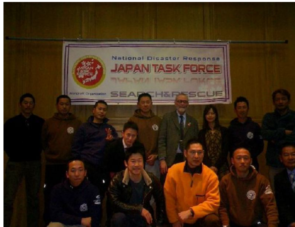
The author (back row, fifth from left) with members of the Japan Task Force for Search and Rescue, Kobe, Japan, February, 2012.

By the time Katrina struck in 2005, FEMA was a shadow of its former self. The agency that sent search and rescue teams to Oklahoma City within two hours after the 1995 terrorist bombing now could not get its act together for Hurricane Katrina despite having two days warning before the hurricane hit the Gulf Coast. Those of us who were still with the agency did our best, but our leaders from the 1990's were gone, and our orders now came from the disaster amateurs at Homeland Security. It was like trying to run a foot race while wearing a ball and chain.