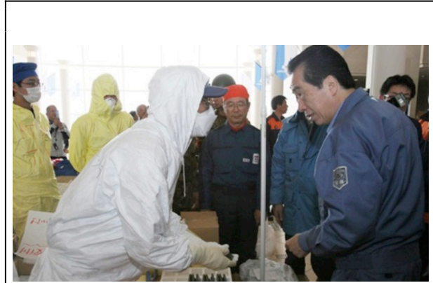
Prime Minister Kan Naoto speaks to an employee of TEPCO at Naraha town, Fukushima Prefecture, Saturday, April 2, 2011.

Tenth, Japan has a wealth of skilled disaster response professionals, but nearly all of this skill lies outside of either the Cabinet Secretariat or the Cabinet Office for Disaster Management, the two Japan Government offices nominally in charge of managing the response to large disasters. Staff who I met from the Cabinet Secretariat and the Cabinet Office for Disaster Management were uniformly bright, dedicated, and hard-working people, but rarely did either they or their leaders appear to have much experience with disasters, and those staff members who gained experience in last year's disaster will soon rotate away to other jobs.