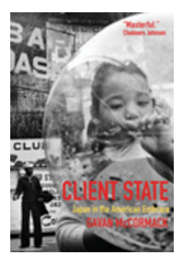
Click on the cover to order.