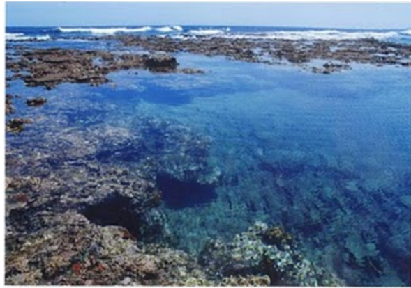
Pristine water off Henoko

As the US faces a financial crisis with no sign of recovery, and a number of difficult related issues, the trend of domestically-oriented policies and national consciousness will continue to accelerate. Even the Republican Party, which believes that a large defense budget is the barometer of state power, and which opposes defense budget cuts, has to accept that there is no such a thing as a 'sacrosanct' sector these days. If the inward-looking philosophy that 'money should be spent only on our own country' spreads further, overseas military forces will undoubtedly become a target to rationalise. Voices calling for 'abolishing overseas forces' have emerged even from within extremely conservative Tea Party groups that influenced recent midterm elections.