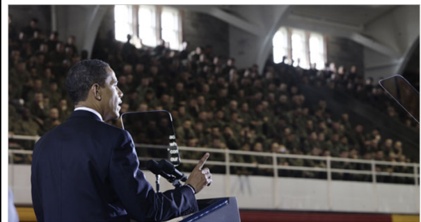
Barack Obama, announcing his decision to withdraw combat forces from Iraq at Camp Lejeune, N.C., on February 27, 2009

On August 31, President Obama delivered a speech from the White House. Because he was expected to declare the end of the Iraqi war, the entire nation focused its attention on the content to the speech. 'Operation Iraqi Freedom is over. ... We have spent over a trillion dollars on this war, often financed by borrowing from overseas. This, in turn, has short-changed investments in our own people, and contributed to record deficits.... Our most urgent task is to restore our economy, and put the millions of Americans who have lost their jobs back to work'. It marked the beginning of a new era, and under other circumstances this speech would have impressed people. The president, however looked troubled, and the atmosphere was gloomy - hardly the context for a forward-looking policy announcement; this was largely due to the severity of the economic crisis the US currently faces.