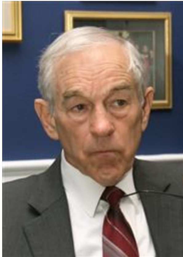
Republican Congressman Ron Paul, in an interview with Kyodo News Agency in mid-February, 2011, dismissed the view of U.S. forces in Japan serving as a deterrent, calling it an excuse to maintain U.S. military forces in the region.

In July, Frank and Paul wrote an article 'Why We Must Reduce Military Spending' for the Huffington Post , the influential political website. In it they explained that 2010 military spending was about $693 billion, over 42% of total government spending, and this is damaging the US economy and reducing people's quality of life. They also pointed out that US intervention in other countries as a superpower often generates anger directed at the US, and concluded that 'rebuilding our economy and creating jobs remains the nation's top priority. It is essential that we begin to address the issue of excessive military