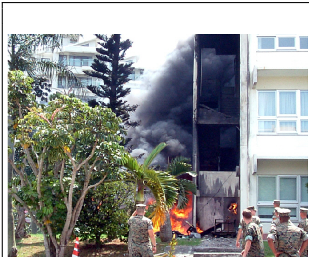
A USMC helicopter crashed into Okinawa International University campus on August 13, 2004.

US government in a very difficult position. Closing down risky Futenma as soon as possible and restoring the unstable Japan-US relationship must surely suit US national interests. If Japan adheres to the existing logic – not to mention its Chief Cabinet Secretary asking Okinawa to accept the burden of the bases – Japan will not find a solution to the Futenma problem. It deserves to be criticised for its sycophantic diplomacy following the US. Fourteen years after the agreement to return Futenma base land to the people, with absolutely no progress, the situation is ripe for change. If we link the new defense trends in the US with the 'all-Okinawa' opposition to relocation inside the prefecture, it is natural to conclude that it is time for reconsideration of the Futenma problem.