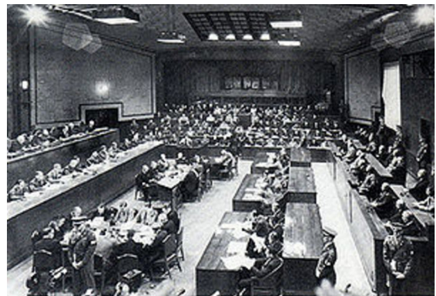
The International Military Tribunal for the Far East in session