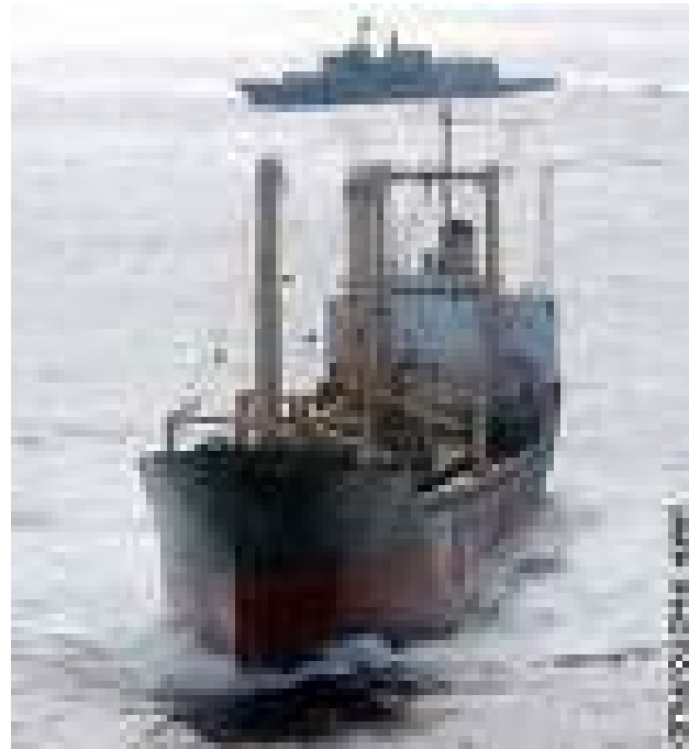
The Pong Su

Following the “strategic decision,” accusations of narcotics, money-laundering, counterfeit currency and tobacco dealing, proliferated and a spotlight was shone on North Korea’s human rights record. Central to the narcotic case was the Pong Su, a North Korean ship seized in Australian waters in 2002 after unloading 150 kilograms of heroin. Two men were tried, convicted and sentenced to long prison terms, but the responsibility of the North Korean state became problematic when an Australian jury acquitted the captain and crew of all criminal charges early in 2006.[26] Japanese allegations of North Korean based amphetamine smuggling (via Japanese gangster groups) and further revelations about the abduction of Japanese, South Korean and other nation citizens in the 1970s and 1980s were given wide publicity, but again evidence of state responsibility is lacking (though by no means implausible).