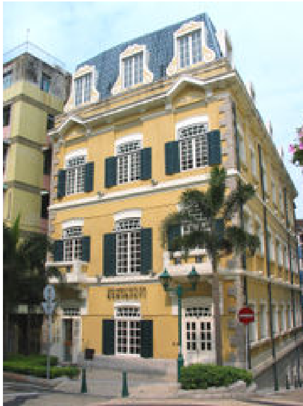
Banco Delta Asia

“Normalization” with such a regime, Washington implied, was no more likely than normalization of relations between the US government and the Mafia. North Korea’s Foreign Ministry spokesman on 11 December retaliated by referring to ambassador Vershbow’s statement as a “declaration of war,” saying the talks were “suspended for an indefinite period,” and a few days later demanding Vershbow’s recall.