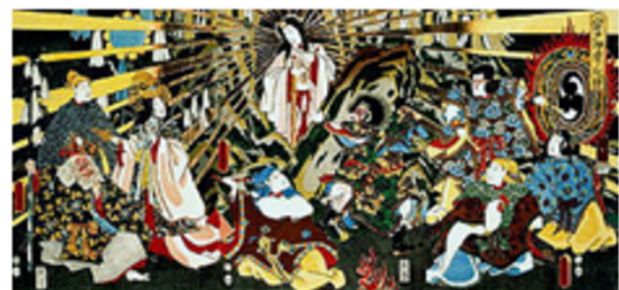
Amaterasu, the sun goddess emerging from a cave to bring light to the universe

Unfortunately, the influence of Nihonjinron on constructing social reality in Japan has often been overlooked by scholars more interested in trampling the ‘bleeding corpse’ (Gill 2001: 577) of a genre of writing that has come to represent something of a straw-man par excellence . As Reader (2003: 111) suggests, the central problem is that critics, perhaps “beguiled by the self-defining rhetoric of uniqueness that pervades nihonjinron”, have come to see such discourses as ‘unique’ to Japan while, at the same time, underestimating the particularities of Japanese culture. In fact, as the following sections illustrate, the opposite is in fact true: Nihonjinron, in the narrow sense of a discourse on national identity, is not unique but the historical materials it draws on and the national culture it helps to (re)create are.