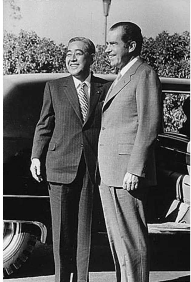
President Richard M. Nixon and Japanese Prime Minister Eisaku Sato meeting at the Western White House in San Clemente, California in January 1972. Nixon and Sato worked out the final details of the Okinawa reversion agreement during these meetings.

The two secret agreements were negotiated during the Cold War, when the United States Navy routinely transited Pacific waters with nuclear weapons onboard and the possibility of a U.S.-Soviet nuclear war was a matter of routine military planning. One of the agreements was actually a record of discussion that established an agreed and carefully defined interpretation of U.S. commitments regarding nuclear weapons, negotiated in 1960, that allowed transit of nuclear weapons through Japanese territory and waters, relegating the consultation requirement to the introduction and basing of nuclear weapons in Japan. The other was part of the 1969 agreement reverting Okinawa to Japan: U.S. nuclear weapons on Okinawa would be withdrawn but re-introduction would be possible in an emergency. Even after the end of the Cold War, which brought the worldwide withdrawal of all U.S. theater nuclear weapons, the U.S. government deferred to the Liberal Democrats on the need to keep the agreements secret, but that need is clearly now moot. Declassification is possible and necessary because determining what Tokyo and Washington actually negotiated is a question of significant historical importance and a key missing piece in the nuclear history of the Cold War.