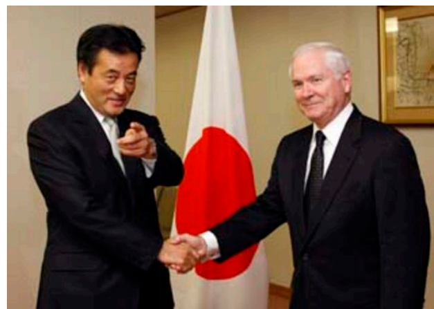
Okada (left) and Gates

One of the Democratic Party's campaign pledges during the September election was establishment of an “equal partnership” with the U.S. based on Japan's national “independence.” When Robert Gates, the U.S. Secretary of Defense, visited Japan in late October, he pressed Okada and Kitazawa Katumi, the Minister of Defense, to make sure that Japan's official investigation of the secret deals would not harm the U.S. policy of nuclear deterrence and the U.S. – Japan relationship.