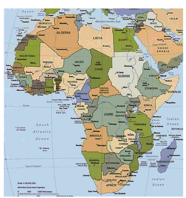
The Origins of Contemporary Somali Piracy

The Asahi Shinbun has reported that Japanese shipping companies began in the autumn of 2008 to reroute some vessels around the Cape of Good Hope at the southern tip of Africa and avoid the more direct route through the Suez Canal. This longer route adds six to ten days to the journey, and may cost Japanese shipping companies, collectively, an annual US$100 million in additional expenses. [1] Ordinarily, Japanese companies send about two thousand ships through the Suez Canal on an annual basis, which would mean that about five or six Japan-affiliated ships pass through the Bab al-Mandab—the "Gate of Tears," the straits separating East Africa from Yemen—on any given day.