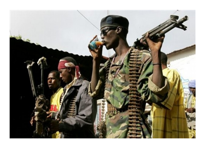
Militia from the Islamic Courts Union

was nearly eliminated by the rise of the Islamic Courts Union (ICU). The ICU cracked down on the pirates and came close to reunifying and bringing peace to the war-torn nation. The ICU failed in this endeavor because of the combined interventions of Ethiopia, which invaded Somalia with its land forces, and the United States, which began funneling support to the old Somali warlords, now calling themselves the "Alliance for the Restoration of Peace and Counter-Terrorism." Both Addis Ababa and Washington intervened because they shared the fear that the establishment of the ICU would be a key victory for "Islamic radicalism" and might serve as a potential base for Al-Qaida. Ethiopian leaders also faced the additional problem of Somali separatist forces operating within the Ogaden region along the border with Somalia.