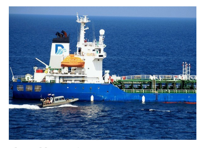
The Golden Nori

In late October 2007 an odd story appeared in the press. A Japanese-owned chemical tanker called the Golden Nori was hijacked off the coast of Somalia. There were no Japanese nationals on board, but the East Asian nation had become entangled, quite unusually, in an East African affair. Unforeseen at that time was that this curious incident would eventually become one of the top foreign policy issues in Tokyo: Somali piracy has emerged as a potential turning point for Article Nine of the Japanese Constitution, and is significant for other reasons as well. The following essay reviews the record of Japanese encounters with Somali pirates and explores the motives and political pressures driving the Maritime Self-Defense Forces (MSDF) toward a proactive role in suppressing East African piracy.