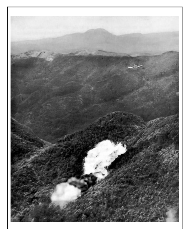
Firebombing in Northern Okinawa

Fighting in the Battle of Okinawa (late March to late June, 1945) was sporadic around Henoko, and in the northeastern part of the main island generally. Still, Henoko residents died in artillery fire and bombing raids, which forced many to abandon their homes for refuge in nearby hills and forests.