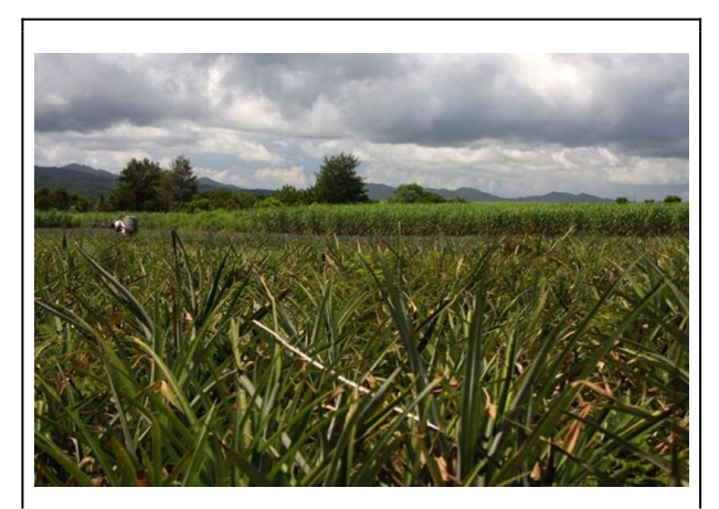
Pineapple farm in Northern Okinawa. Tea and sugar are also widely grown.

What Inoue calls an "entertainment quarter," officially termed an "amusement area" by the U.S. military, was located on a plateau of high ground separated from residential Henoko below by a sharp embankment. Both sections of the village were accessible from the main highway that ran along the eastern coast of Okinawa, but, as if to keep them separate, they were connected only by a steep and narrow dirt path through high grass and trees on the hillside between them. After construction of the two bases in 1959, the population of Okinawans in Henoko swelled to approximately 2100 residents and 900 transient workers.<sup>17</sup> A bus terminal was built in the residential section to serve the growing number of commuters working base-related jobs, while a fleet of taxis based in the "amusement area" served the generally more affluent American G.I.'s, few of whom rode the buses.