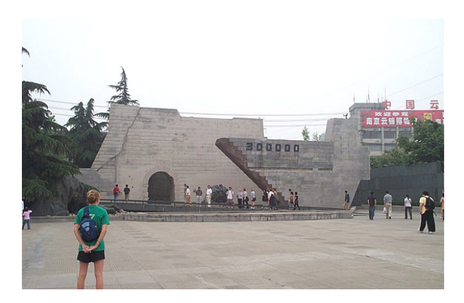
Memorial and Museum for Nanjing Massacre

The strengthening of nationalistic education in China can be traced back to the Japan's history textbook controversy of 1982. The importance of resistance to Japanese aggression in China's nationalistic education is clearly demonstrated by the construction of the Nanjing Massacre Museum in Nanjing and the Memorial Hall to the Chinese People's Anti-Japanese War immediately adjacent to the Marco Polo Bridge, site of the outbreak of the Sino-Japanese War. Both museums, their names written in glittering gold characters, were constructed under Deng Xiaoping's instructions. Japan's history textbook controversy stirs Chinese memories of Japan's war of aggression against China which unfolded after the May Fourth Movement of 1919. The May Fourth movement was not only directed against Japan's Twenty-One Demands, it is the very embodiment of China's nationalist movement. The fact that Japan has shown not the slightest sincerity toward learning from the past has fostered deep Chinese suspicion.